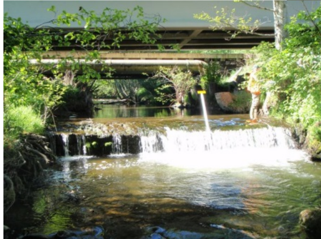
Sewer Line encased in concrete