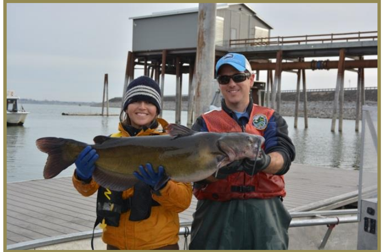
WDFW biologists with a 20lb. Channel Catfish collected on Potholes Reservoir, October 2015.

Potholes Reservoir is one of the most popular fishing destinations in Washington. It is a 28,200-acre reservoir in Grant County, formed by the construction of O’Sullivan Dam across the Crab Creek Valley in 1949. Known as a very popular Walleye fishery, Potholes also hosts a wide variety of other gamefish species including Largemouth and Smallmouth Bass, Bluegill, Black Crappie, Channel Catfish, Rainbow Trout and Bullhead. More recently, large Bluegill and Black Crappie are more frequent in angler catches as well as the occasional 20lb Channel Catfish. Anglers in search of large catfish should focus their efforts on Potholes Reservoir. (Check for Special Regulations)