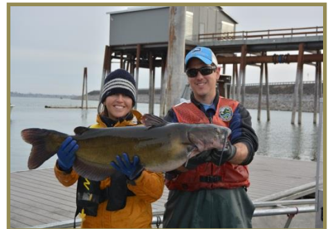
Above (L to R): Stocking juvenile Tiger Muskies into Evergreen Reservoir, Walleye tournament weigh-in on Moses Lake, WDFW biologists with a 20lb Channel Catfish from Potholes Reservoir.