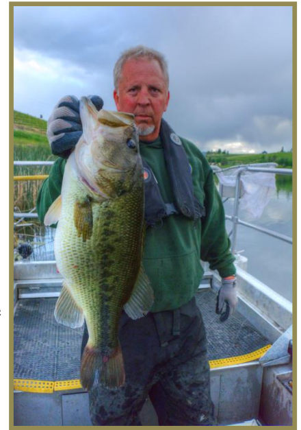
Largemouth Bass collected on Dry Lake, May 2016.

Dry Lake, covering 94 acres, is situated approximately 1.5 miles northeast of Lake Chelan and the city of Manson in Chelan County, Washington. Access to the lake is confined to a small, improved area at the East end, allowing for boat launching. Unfortunately, there are no restroom facilities available on site. Largemouth Bass and Bluegill are the dominant two species in Dry Lake. Bluegill have been observed up to 10.5 inches, while the Largemouth Bass may reach sizes up to 22 inches and over 6lbs. The population of Largemouth Bass is ideally structured to support the production of large Bluegill. Additionally, expect to catch lower numbers of Black Crappie, Yellow Perch, and Brown Bullhead as well. To enhance angler opportunities and improve the size structure of Bluegill, we introduced 1,100 adult Largemouth Bass into Dry Lake during the spring of 2015. Subsequently, in 2017, we successfully negotiated with private landowners, leading to the opening of a new public access point located at the northeast corner of the lake. This access point offers limited parking and allows for the launching of small boats. (Statewide Regulations Apply)