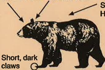
No Shoulder Hump

Look for a combination of characteristics.