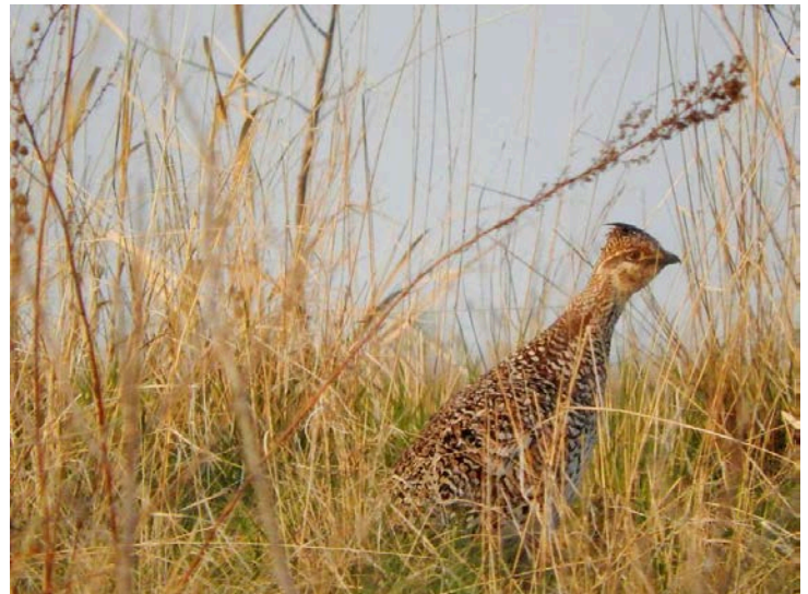
Columbian sharp-tailed grouse.