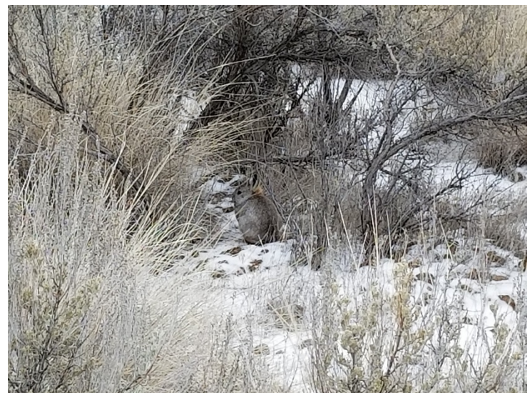
Columbia Basin pygmy rabbit.

For more information, contact your local service center and USDA Farm Service Agency office at farmers.gov/service-center-locator , or the Washington Department of Fish and Wildlife private lands biologist for your area at wdfw.wa.gov .