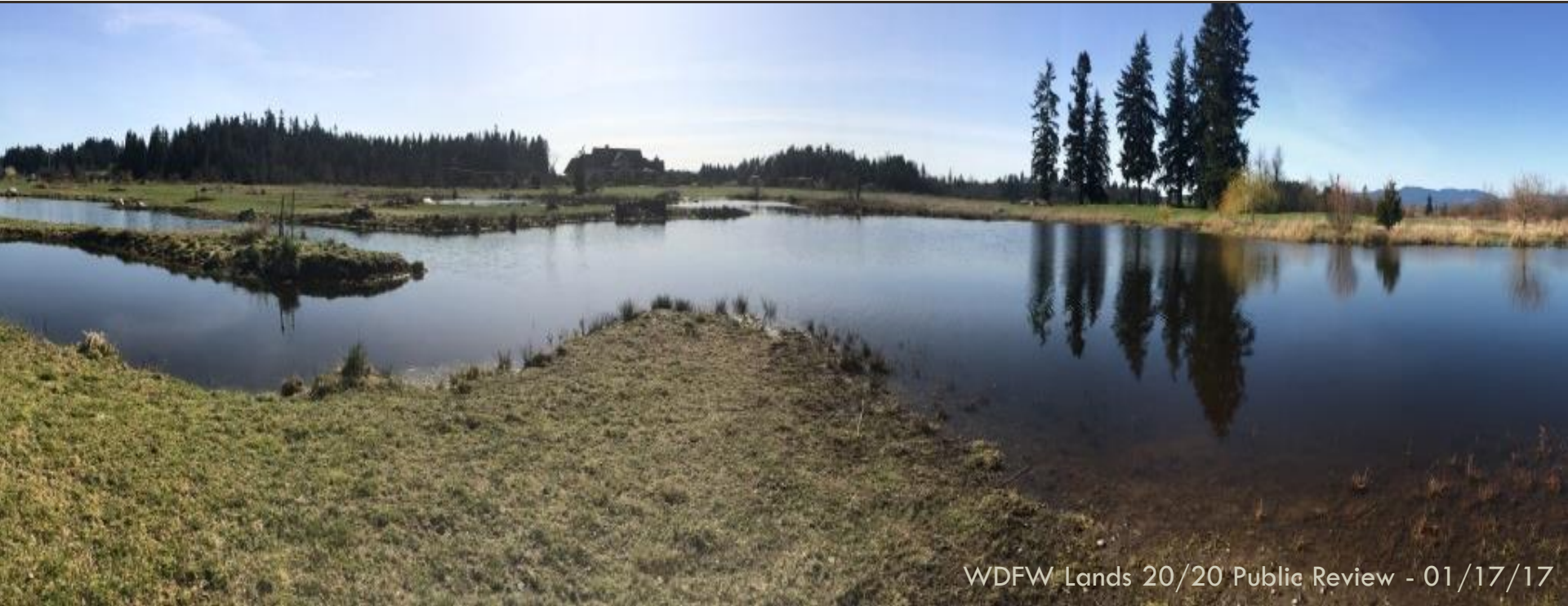
WDFW Lands 20/20 Public Review - 01/17/17