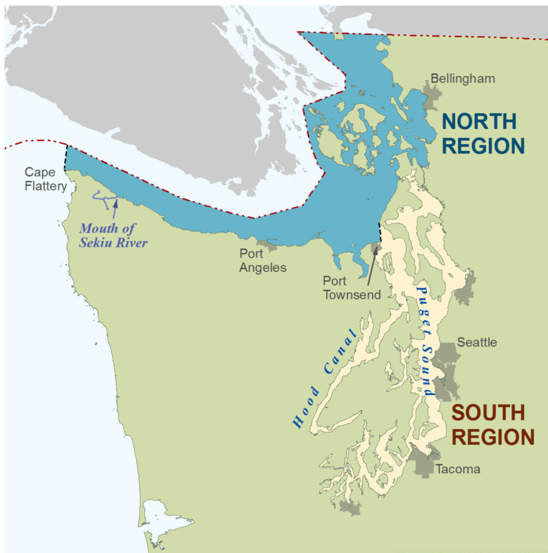
Figure 1. Map of Puget Sound showing management regions.