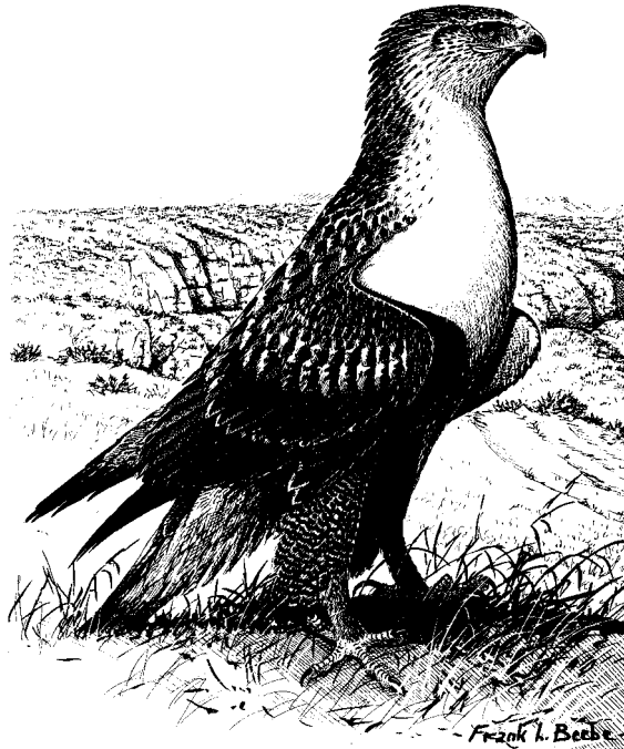
Illustration by Frank L. Beebe; used with permission of Royal British Columbia Museum; http://www.royalbcmuseum.bc.ca/