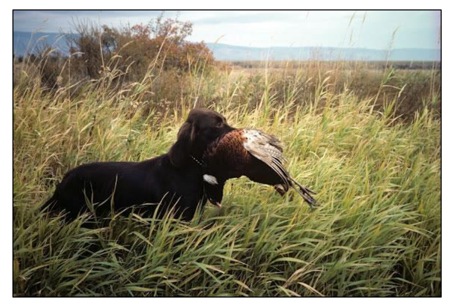
the cut fields for birds that didn't travel far from their former hiding spots.

Pheasants like to roost or rest in tall cover. Try walking any ditch that has cover and is fairly close to agricultural fields. Cattail patches, standing crops (with farmer approval), thick stands of Russian olive and other trees, and high bushes are great placed to try hunting for pheasants. In areas where corn and other grain or seed crops have been recently harvested, hunt the cover