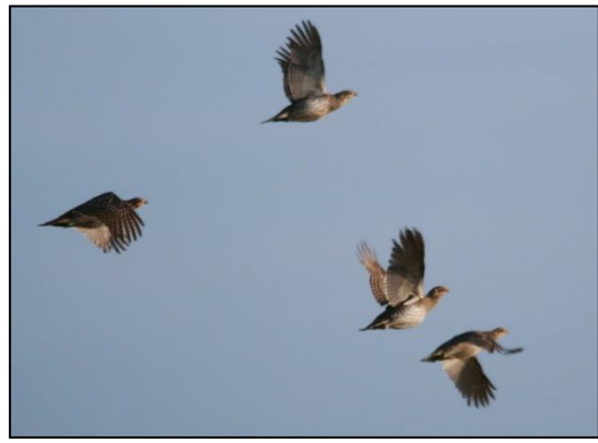
Flying sage grouse