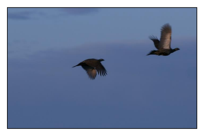
Flying sharp-tailed grouse

There are six grouse species that call Washington State home. They are the ruffed grouse, sooty grouse, dusky grouse, spruce grouse, sage grouse, and sharp-tailed grouse. Four of the six grouse are open for hunting in Washington. The sage and sharp-tailed grouse are protected endangered species and it is illegal to hunt them. These two grouse are generally found in prairie areas. Large scale wildfires in 2015 altered the prairie habitats and home ranges of these species. Some of the populations may have moved closer to forest grouse habitats. It is imperative to identify the grouse prior to shooting because of their close resemblance.