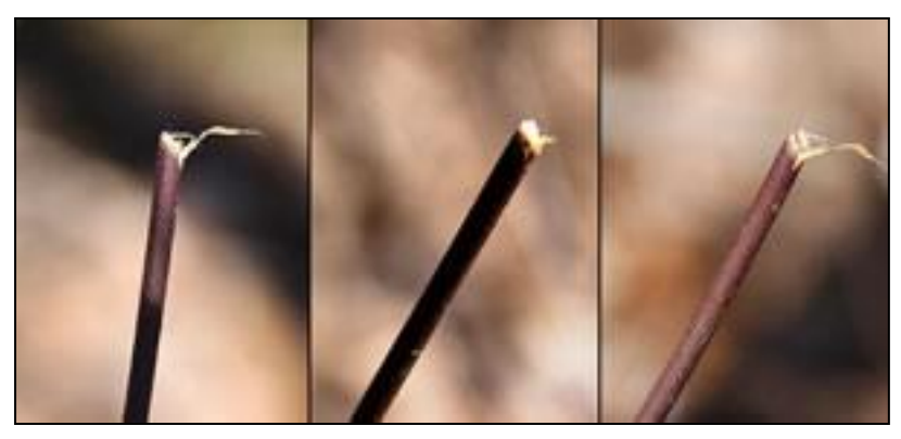
Examples of bushes browsed by deer

Deer tend to feed before dawn, and if undisturbed, continue until several hours after sunrise. After feeding, deer will bed down for most of the middle hours of the day. Although it is common for bedded deer to get up and feed for 30 to 60 minutes around noon, then bed down again. Deer will return to feeding late in the afternoon and continue until after sunset.