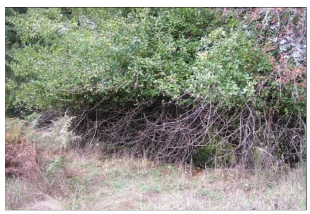
A browse line

Deer eat a wide variety of plants, ranging from newly sprouted grasses and forbs in the spring to fir needles during the winter. In general, deer tend to be browsers, eating the growing tips of trees and shrubs. In late winter and early spring, deer eat grass, clover, and other herbaceous