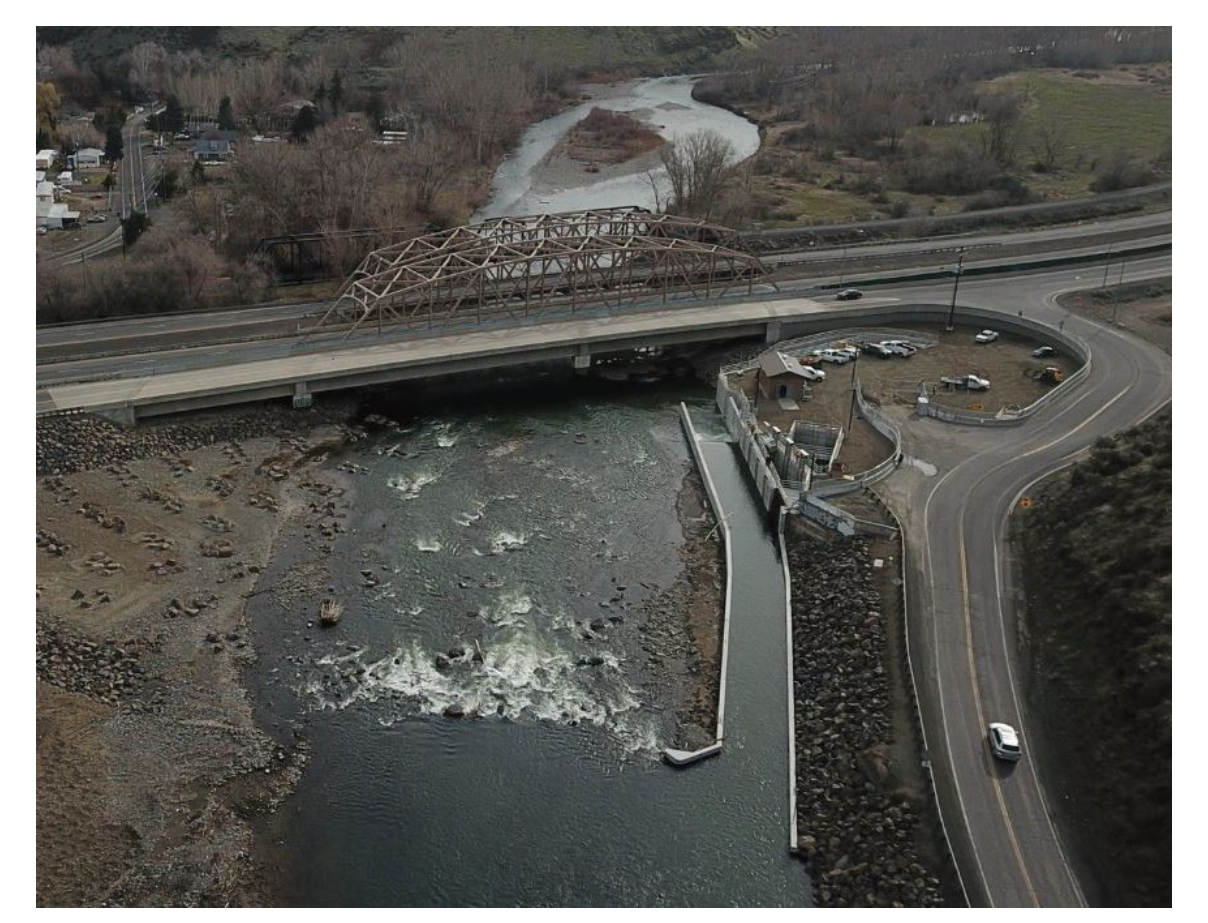
After: Fully passable crest based roughened channel.

Before: 33% passable barrier, 180 ft. by 8ft., full span concrete dam.