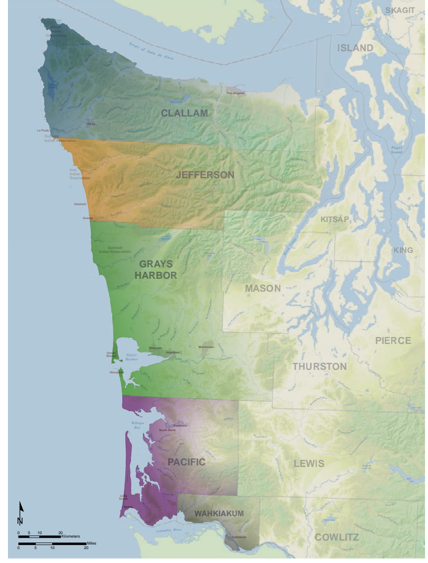
Map 1. Coastal MRC Counties are highlighted.

MRCs are still rapidly building their capacity and organization structure, but this calendar year has seen a significant increase in MRC activity and accomplishments. Table 1 summarizes planned Program