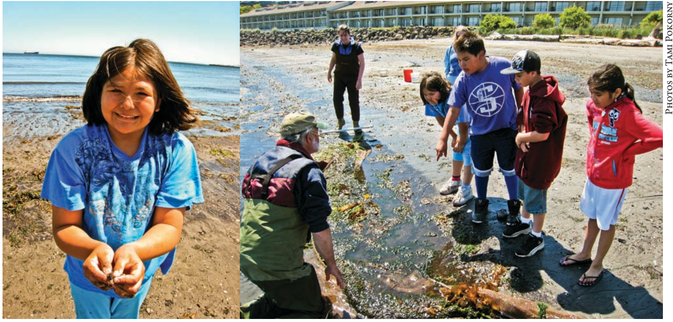
Figure 4. Students from the Queets Clearwater School District at the Fiero Marine Life Center, May 2009.

Jefferson and Clallam Exploratory MRC activities included conducting a citizen interest survey and several outreach events in 2009. Jefferson and Clallam E-MRCs participated in the 2009 Washington Clean Coast Alliance/Coast Savers annual garbage clean up in April and supported data processing and reporting through the purchase of clip boards and datasheets for the event. The MRC also funded dumpster tipping fees to dispose of garbage collected at this event. In late spring, The E-MRCs organized and sponsored two field trips to the Fiero Marine Life Center for students at the Queets Clearwater, Quileute Valley, and Cape Flattery School Districts (Figure 4). The E-MRC was also pleased to host the State Ocean Caucus and provide introductory remarks at their June outreach meeting in Forks.