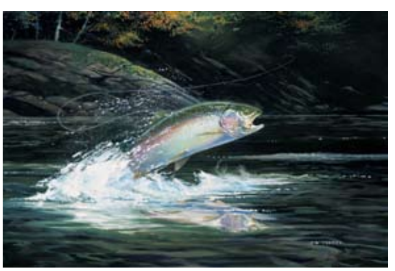
Cover Illustration Courtesy of Fred W. Thomas Prints are available. Visit: <a href="www.fwthomas.com">www.fwthomas.com</a>

Priest Rapids Reservoir (Grant Co.) Rock Lake (Whitman Co.) Roses Lake (Chelan Co.) Wanapum Reservoir (Grant Co.) Whitestone Lake (Okanogan Co.) Windmill Lake (Grant Co.)