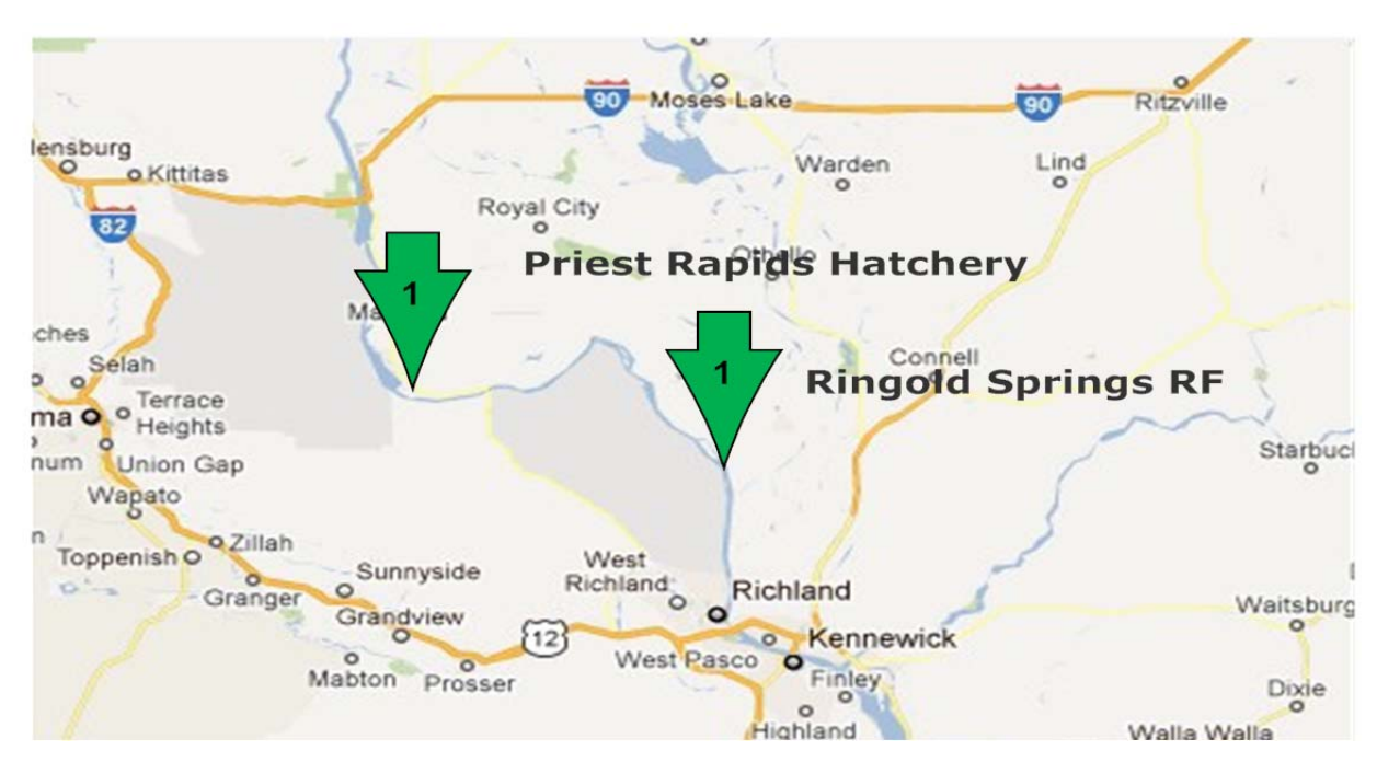
Figure 1. Project Area Map.

The Hanford Reach is a 56-mile segment of the Columbia River located between the upstream end of McNary Dam reservoir and Priest Rapids Dam. It is the only sizeable un-impounded reach of the mainstem Columbia River upstream of Bonneville Dam. Fall Chinook salmon continued to successfully use Hanford Reach spawning and rearing habitat as other production areas became inundated by reservoirs. The Hanford Reach contains the most significant area of URB fall Chinook salmon production in the mainstem Columbia River and are considered a higher quality food fish compared to the lower Columbia River tule fall Chinook salmon.