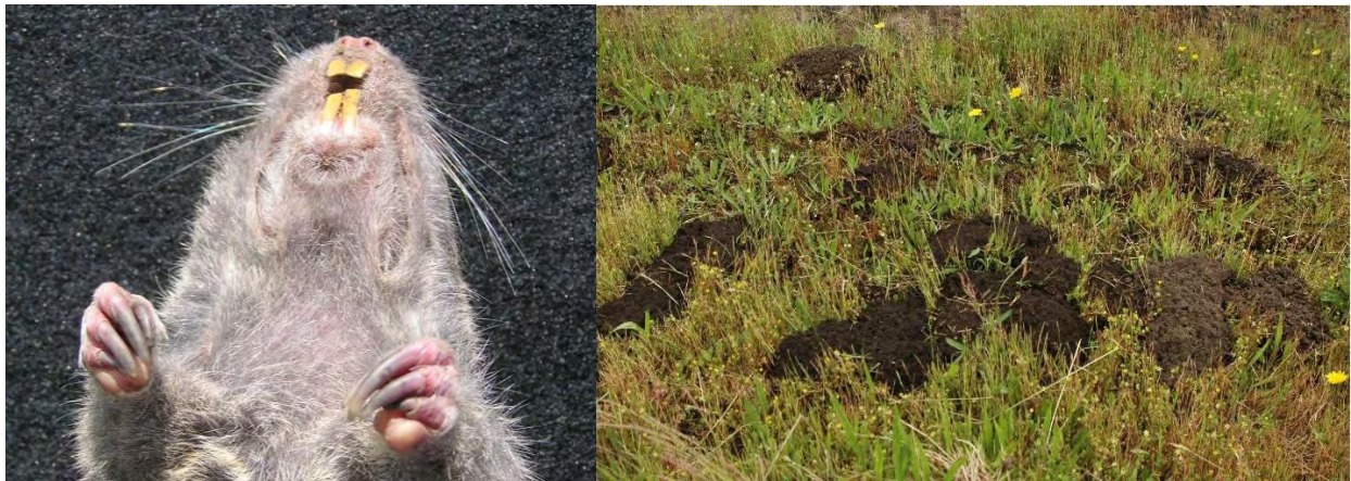
Figures 2,3. Mazama pocket gopher showing characteristic incisors, front claws, and cheek pouches (left), and soil mounds created by a gopher (right).

The Mazama pocket gopher is one of the smallest of 35 species in the pocket gopher family. In Washington, it is only found west of the Cascades. It differs from the similar-sized northern pocket gopher ( T. talpoides ) of eastern Washington in fur color, tooth and skeletal characteristics, and a larger dark patch of fur behind their ears. Pocket gophers spend most of their time within their system of burrows. They are frequently confused with moles, but moles do not have prominent teeth (Figure 2), and the soil mounds that they leave behind are dome-shaped while the mounds left by gophers are often lower and more irregular or fan-shaped. Gophers are believed to be generally solitary and exclude other gophers from their burrows except when breeding and when females have litters. When pocket gophers have established a territory, they generally remain there, although they will shift their home range in response to seasonally wet soils.