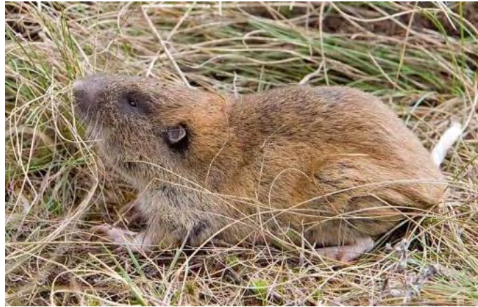
Figure 1. Mazama pocket gopher (photo by Rod Gilbert).

The Mazama pocket gopher was state-listed as Threatened in 2006. In 2012, four subspecies were proposed for listing as Threatened under the Endangered Species Act (USFWS 2012).