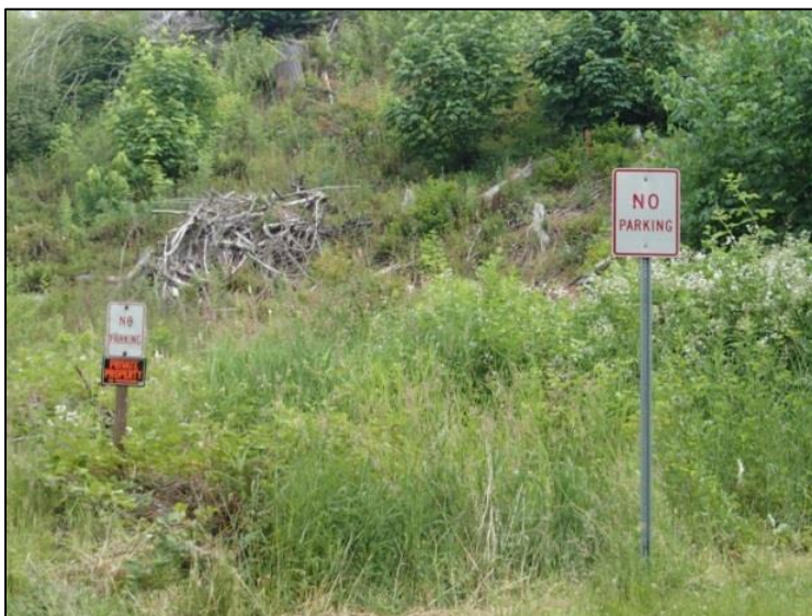
Typical no parking/no trespassing signs in rural areas of District 13.

Early scouting is always important, particularly in District 13. If fire danger is extraordinarily high, access may be closed to the public for all activities. If this happens, notices may be posted at property gates.