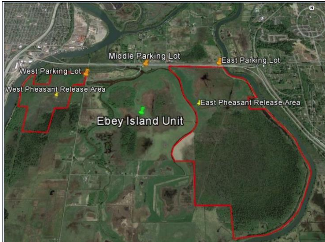
Parking and pheasant release areas available at Ebey Island

The Leque Island aka Smith Farm site will be closed to pheasant hunting due to the changes to the site from the first phase of the Leque Island Tidal Restoration Project.