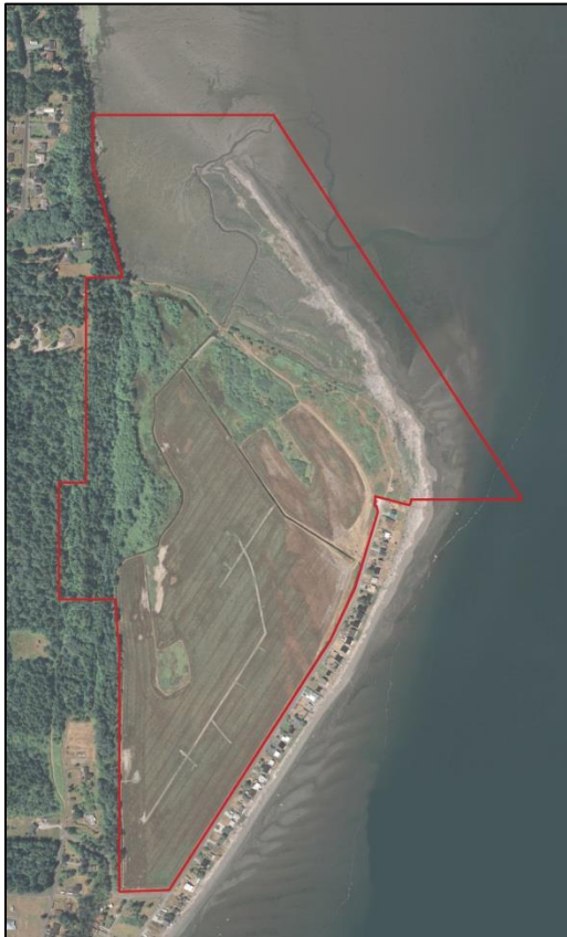
Iverson Spit Preserve park boundaries

Iverson Spit Preserve is managed by Island County Parks, within the Island County Public Works Department. Hunting is allowed at Iverson Spit outside of the dike in the intertidal area. Questions regarding the preserve should be directed to the Island County Public Works Department at (360) 679-7331.