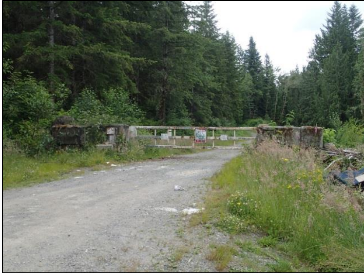
P-5000 Road access gate

At the south end of GMU 448, walk-in access is available off the Sultan Basin Road. This area has mixed public and private ownership, and hunters should pay close attention to signs designating areas where the discharge of firearms is prohibited. Access to DNR lands requires a Discover Pass, and these areas will have signage. DNR properties are gated, and shooting is permitted only during legal hunting seasons.