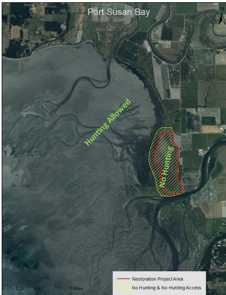
Map of restricted hunting area owned by The Nature Conservancy

The Nature Conservancy (TNC) allows hunting over a majority of tidelands under their ownership at Port Susan Bay. However, the restored area, which used to be diked, and a 150-yard buffer around it is off limits to hunting, and there is no hunting access from TNC property (see map below). For further information regarding hunting TNC ownership, contact the TNC Puget Sound Stewardship Coordinator at (360) 419-3140 or washington@tnc.org .