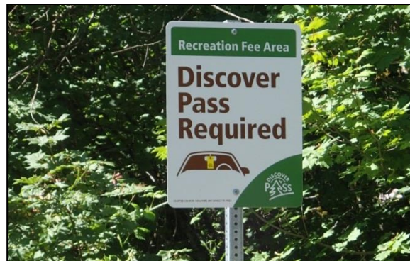
Typical DNR signs

GMU 450 includes portions of Districts 13 and 14. Sixty-seven hunters reported hunting in the unit, but no deer were harvested. GMU 407 includes portions of Districts 12, 13, and 14. In 2017, 116 hunters harvested 469 deer from GMU 407 resulting in a 22 percent success rate. Most of the unit is private land and some areas are firearm restricted. In Snohomish County, hunters should consult page 92 of Washington’s 2018 Big Game Hunting Seasons and Regulations. The