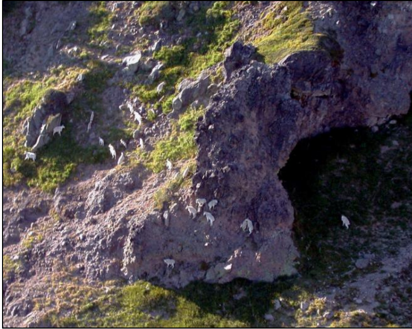
Mountain goats in the Boulder River North goat hunt unit