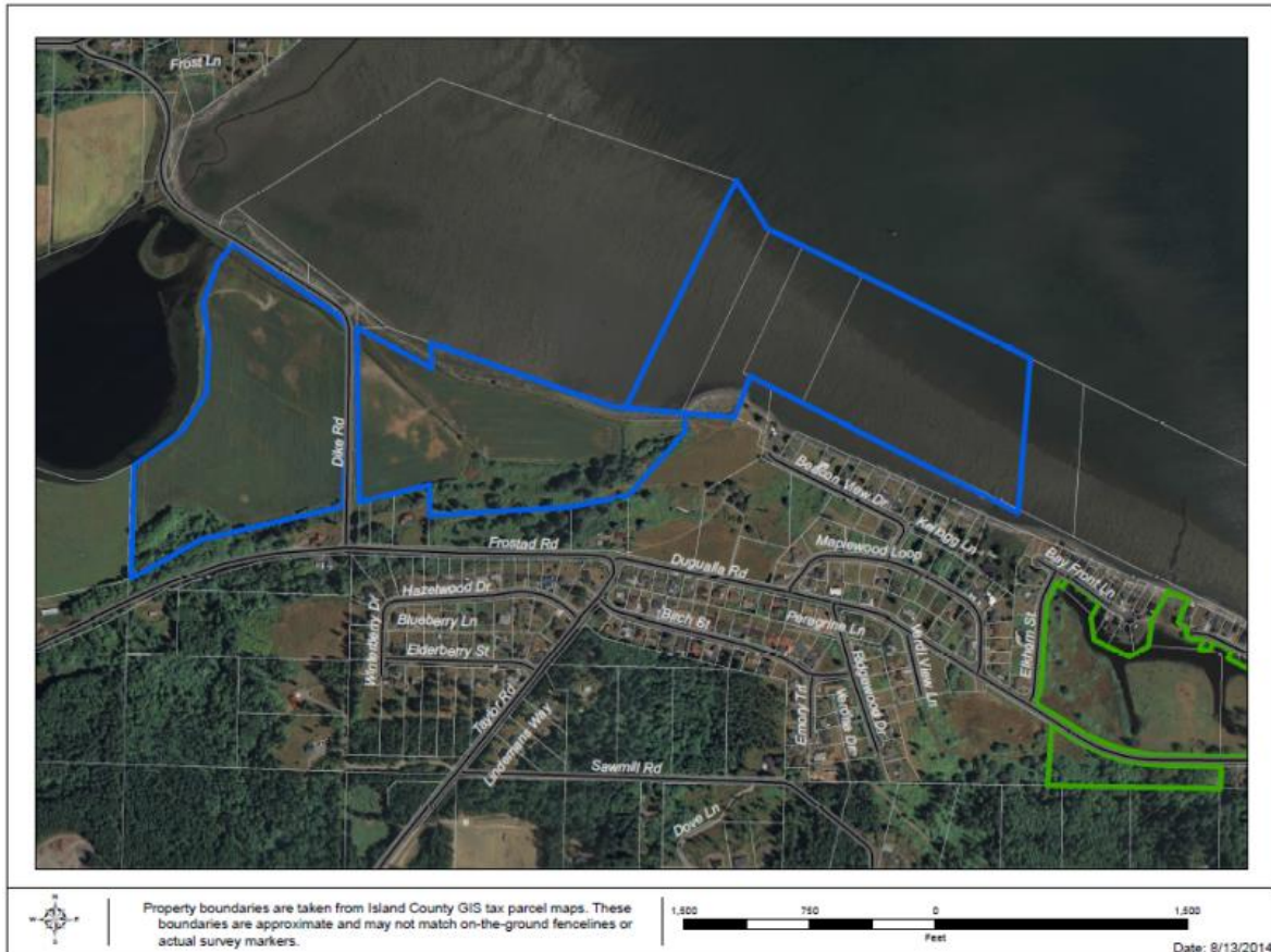
Whidbey Camano Land Trust parcels (in blue and green) at Dugualla Bay

Access to public lands on Whidbey Island is extremely limited. Hunters should be aware that Deer Lagoon is closed to hunting by a County Ordinance that restricts the discharge of firearms. The Whidbey Camano Land Trust owns parcels at Crockett Lake and Dugualla Bay, and their ownerships are closed to hunting. Land Trust Dugualla Bay parcels are shown here. Hunters should contact the Whidbey Camano Land Trust with any questions regarding boundaries and ownership at Crockett Lake.