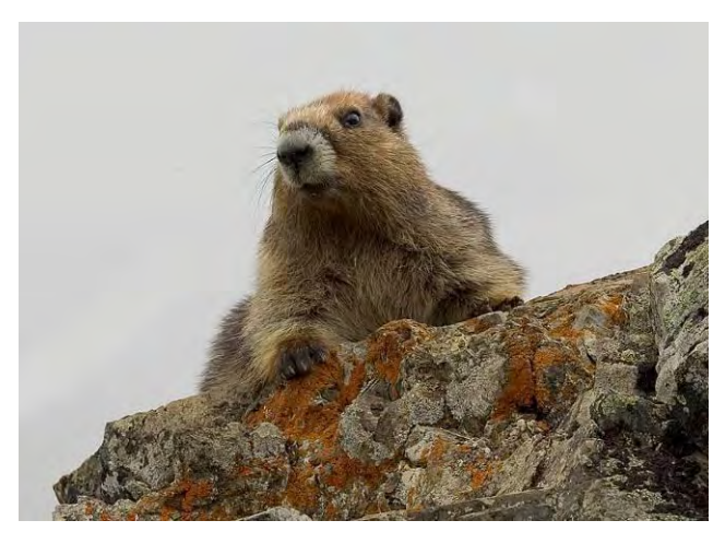
Figure 1. Olympic marmot (photo by Rod Gilbert).

The Olympic marmot is an endemic species, found only in the Olympic Mountains of Washington (Figure 1). It inhabits subalpine and alpine meadows and talus slopes at elevations from 920-1,990 m (Edelman 2003). Its range is largely contained within Olympic National Park. The Olympic marmot was added to the state Candidate list in 2008, and was