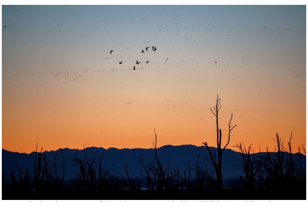
Ducks and snow geese in flight as the sun sets over the Skagit Wildlife Area and Skagit Bay.