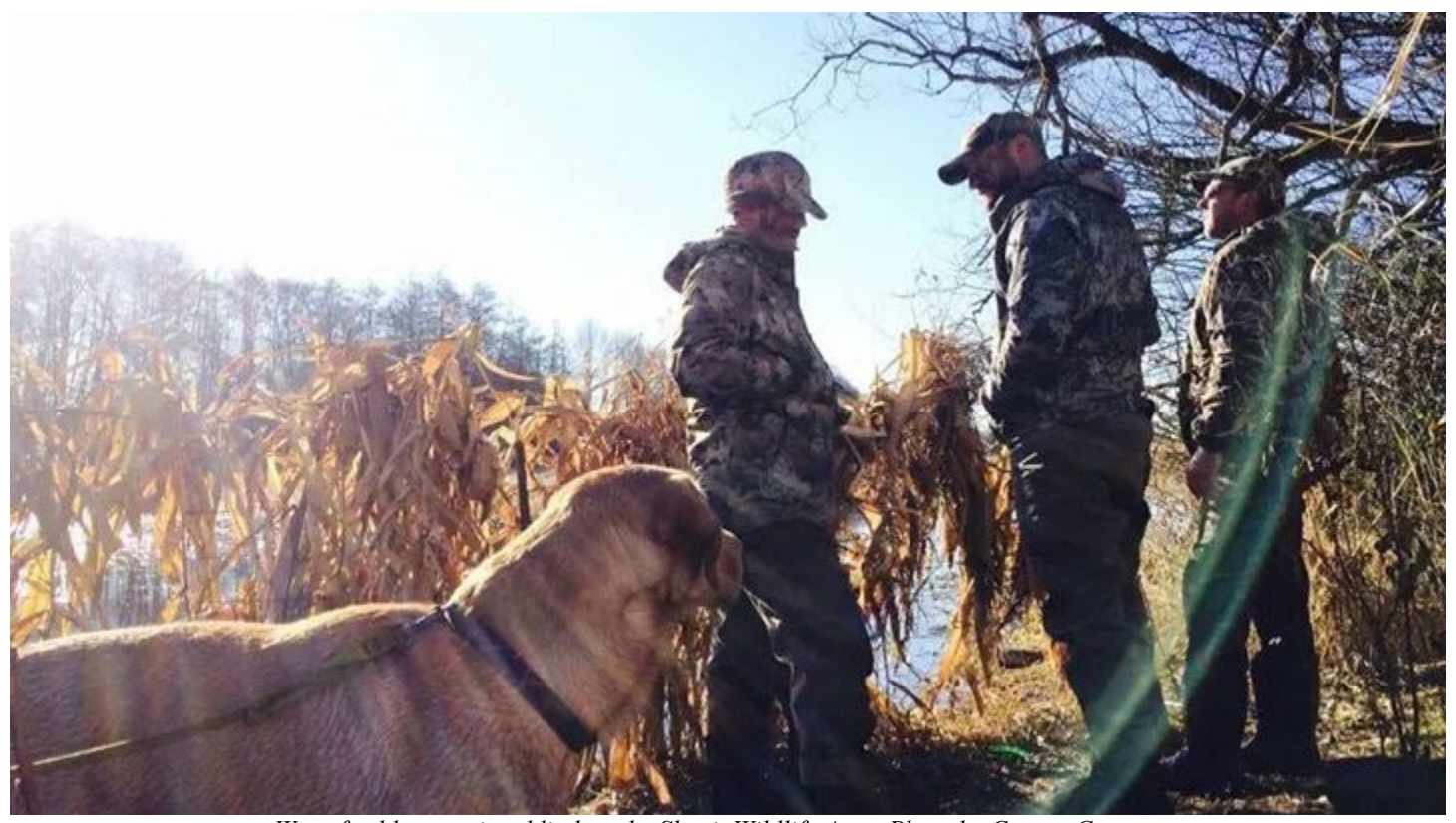
Waterfowl hunters in a blind on the Skagit Wildlife Area.

The <u>Skagit Wildlife Area</u> is a very popular site for Pacific Northwest waterfowl hunters and offers hunting opportunities for both ducks and geese. The Skagit Wildlife Area is also popular for other wildlife-related activities such as birdwatching, photography, hiking, and kayaking. The Skagit Wildlife Area office is on the Headquarters Unit, located two miles southwest of Conway, from exit 221 on Interstate 5.