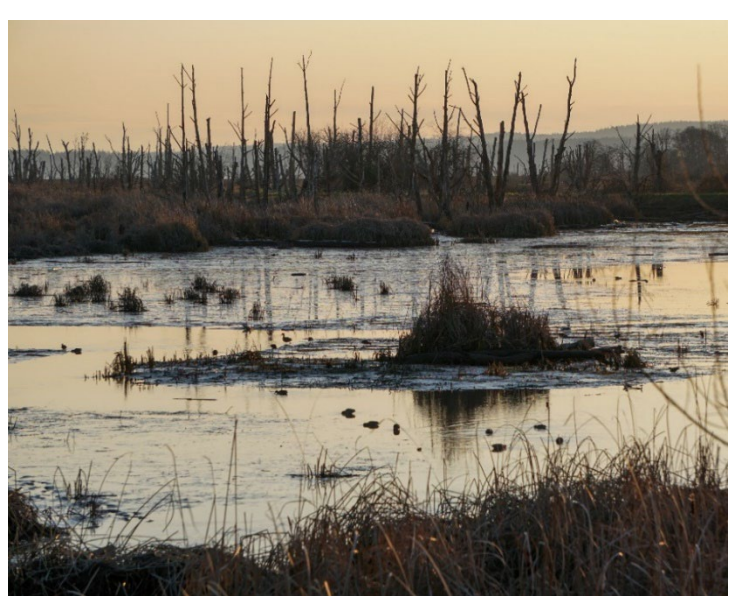
Mallards, green-winged teal and other waterfowl feeding at low tide at the Headquarters Unit of the Skagit Wildlife Area.

However, if hunters set up with sufficient distances between groups, are courteous to one another, and obey the "15 shell" limit regulations on the Samish, DeBay's Slough Hunt Area, and Island Units, hunting can still be very productive. Blinds managed through the WDFW Private Lands Hunting Access program at the South Padilla Bay and Samish River Units are also subject to the 15-shell limit regulation.