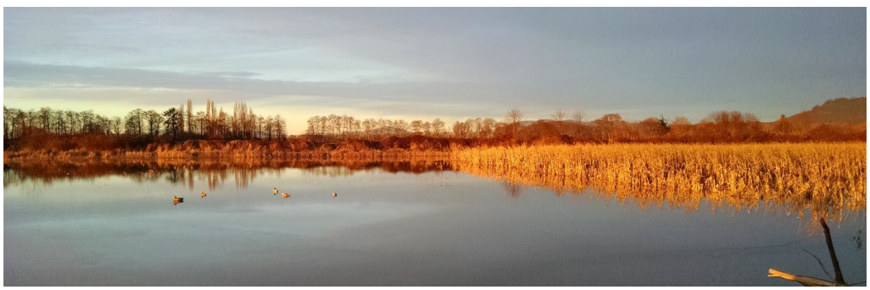
Decoys at the Island Unit of Skagit Wildlife Area.