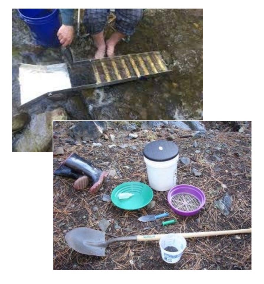
Examples of prospecting equipment