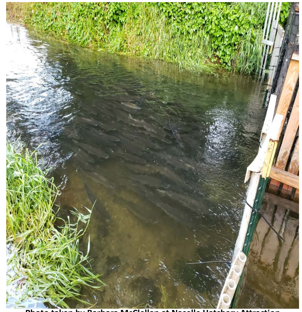
at Naselle Hatchery Attraction Channel