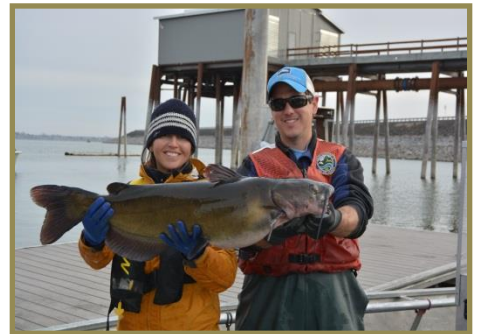
Above (L to R): Stocking juvenile Tiger Muskies into Evergreen Reservoir, Walleye tournament weigh-in on Moses Lake, WDFW biologists with a 20lb Channel Catfish from Potholes Reservoir.