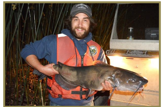
20 lb. Channel Catfish collected on Roses Lake, June 2015.

Roses Lake is located approximately one mile northeast of Lake Chelan and 1 mile north of Manson, Washington. The lake is 131 acres, and a maximum depth of approximately 30 feet. Roses Lake is managed as a mixed species Rainbow Trout and warmwater fishery. We surveyed Roses Lake in the fall of 2004 and since then we have revisited the lake several times to monitor the Largemouth Bass and Bluegill populations. There is also a healthy Channel Catfish population in Roses Lake – some of which are very large (see photo). The band of bulrush and cattail surrounding Roses Lake holds many large bass. Anglers should focus on these areas as they provide excellent cover for both bass and the small prey fish that bass prey upon. (Statewide Regulations Apply)