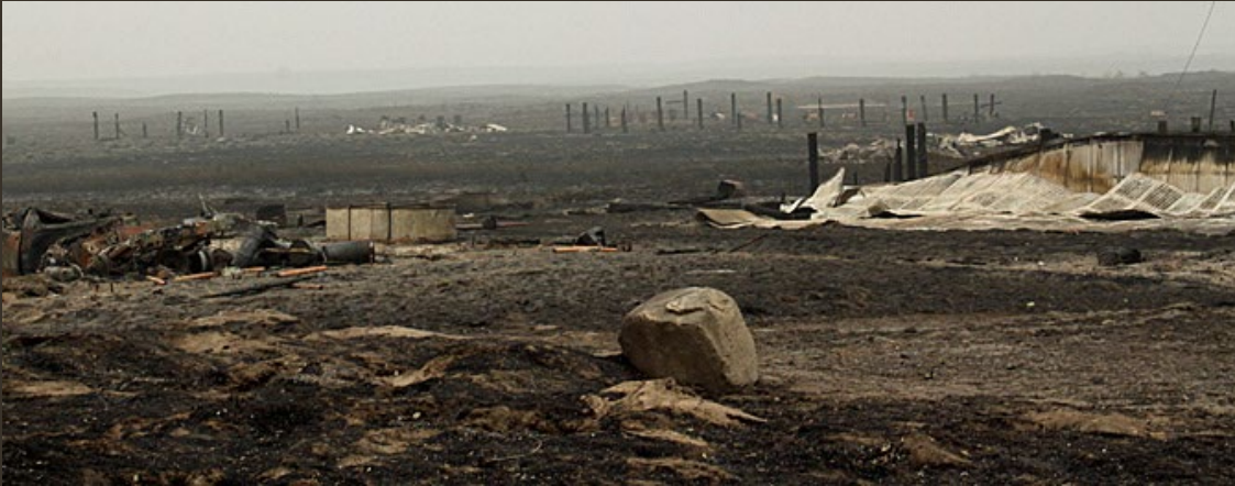
Box 2 Figure. Burned fence posts in the Swanson Lake Wildlife Area following a wildfire in 2020.

One of the most costly impacts stemming from weather and climate-related events to WDFW is replacing miles of fencing after wildfires burn the wood posts. Since 2009, the agency has altered its fence construction materials, using 2-inch steel pipe that is able to withstand wildfire events. While the steel posts are a higher upfront cost, the agency is ultimately saving money on both materials costs and staff time, because the steel posts are much less likely to need replacement.