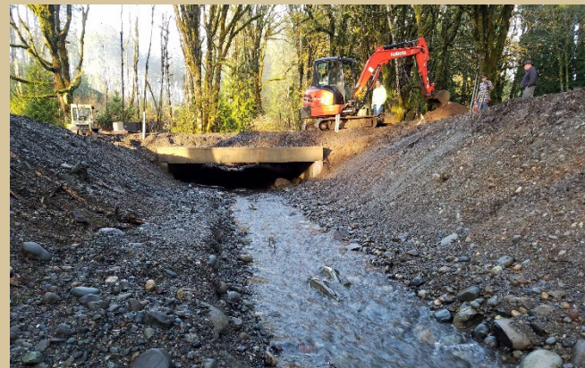
Box 3 Figure. A culvert replacement project in Potlatch State Park..

Many culverts across the state are currently inadequate for fish passage and unable to withstand higher future peak streamflows. WDFW has studied the required culvert widths to accommodate projected future streamflow and fish passage. That information is being used as the basis for the climate adapted culverts tool being developed by WDFW and the University of Washington Climate Impacts Group. This tool estimates the likelihood that a particular culvert size will fail as a result of projected future flows over a user-specified design lifetime. Using this tool and other information to design and construct more climate-adapted culverts can help these critical elements of our infrastructure function under future conditions and also improve habitat connectivity for fish.