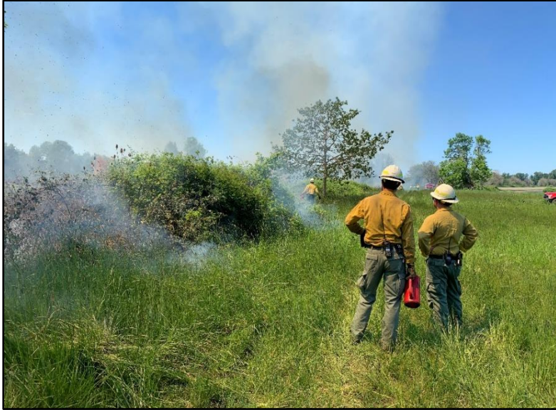
Prescribed burning near Bass Lake