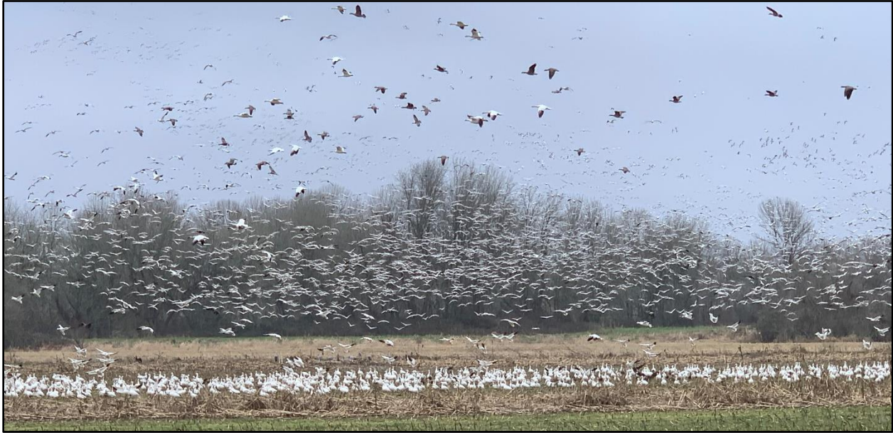
Geese at the South Unit cornfield

This document is intended to highlight accomplishments as they relate to goals and objectives identified within 2006 Shillapoo Wildlife Area Management Plan. The plan addresses the status of wildlife species and their habitat, ongoing restoration efforts, and public recreation opportunities at the Shillapoo Wildlife Area. Every 10 years, WDFW develops a process for revising management plans for each wildlife area to identify new management priorities and actions. In between plan revisions, the update focuses on recent accomplishments over the last two years.