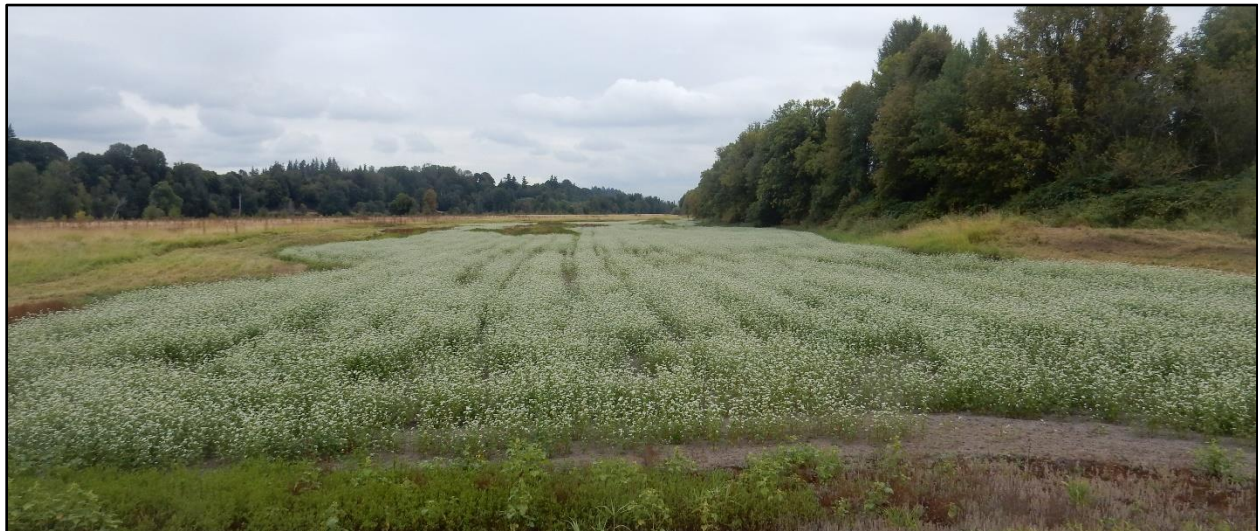
Blaker's Lake planted with a cover crop of buckwheat

To enhance native wetland plant communities, wildlife area staff members conduct moist soil management on 30-70 acres annually. The most successful approach to increase native plant cover while decreasing invasive vegetation includes the following field activities: herbicide application, winter inundation/flooding, spring disking, and cover crop planting. This technique is repeated every 3-5 years in each of the wetlands. This technique results in an increase of over 60 percent of native cover after 1-2 years of treatments.