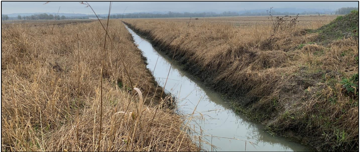
Lakebed drainage ditch, proposed to be blocked to increase inundation levels

The $8-10 million Shillapoo Ecosystem Restoration Feature (SERF) project, which would have restored hydrology to approximately 900 acres in the historic Shillapoo lakebed, is a long-term management goal. However, the original funding for the project is no longer available, and currently there is no alternative funding. Wildlife area staff members remain interested in enhancing hydrology within the lakebed, and have developed a smaller project to block some of the drainage ditches. The smaller project should benefit native wildlife and plant species on more than 150 acres by keeping the area inundated longer with water during the winter and spring months. The approximate cost of this project is $100,000.