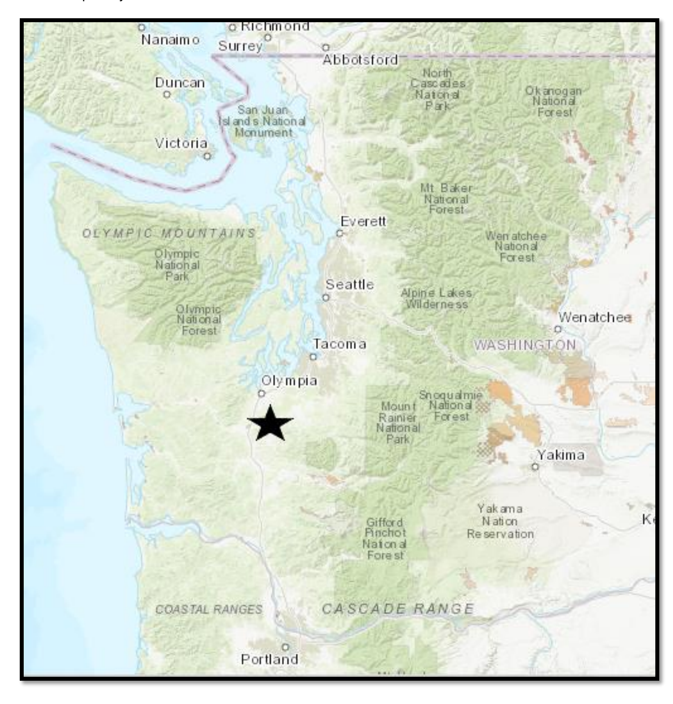
Locator map: Project location marked with the black star