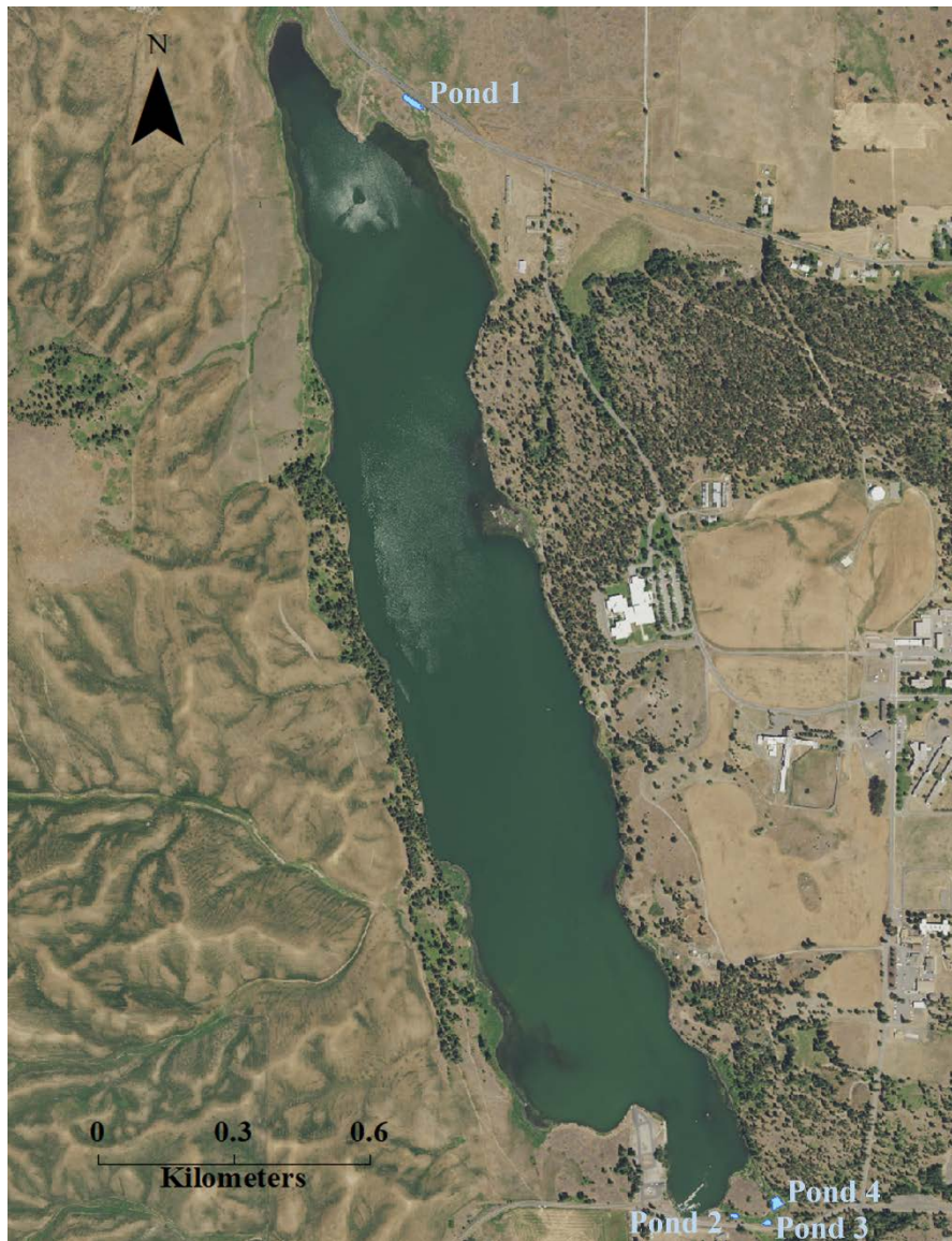
Figure 2. West Medical Ponds.