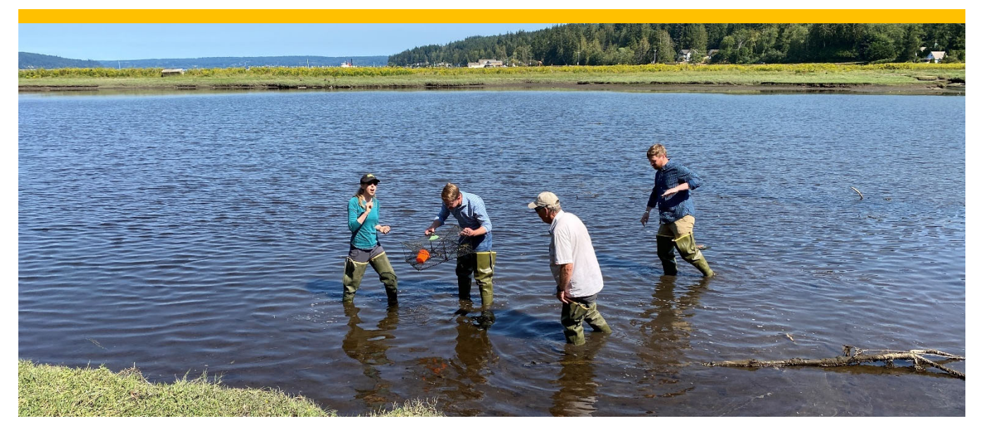
U.S. Representative Derek Kilmer and staff from Washington Sea Grant and WDFW check traps for green crab in early September.

Public Update on European Green Crab Management – September 2022