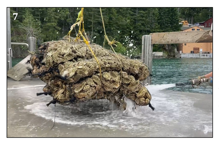
Photo 7: WDFW worked with the Hood Canal Oyster Company to study ways of reducing the risk of EGC transfer in shellfish product intending to be distributed around the state for recreational and aquaculture purposes. In this picture, several bags of oyster cultch have been lifted on a barge and are being washed with a high-pressure water hose to flush out EGC and any other species. The bags are then separated and washed again. No EGC were found in this situation.