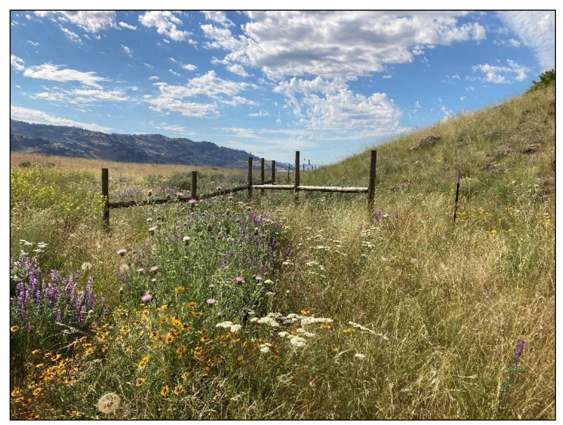
Chiliwist wildflowers and fence