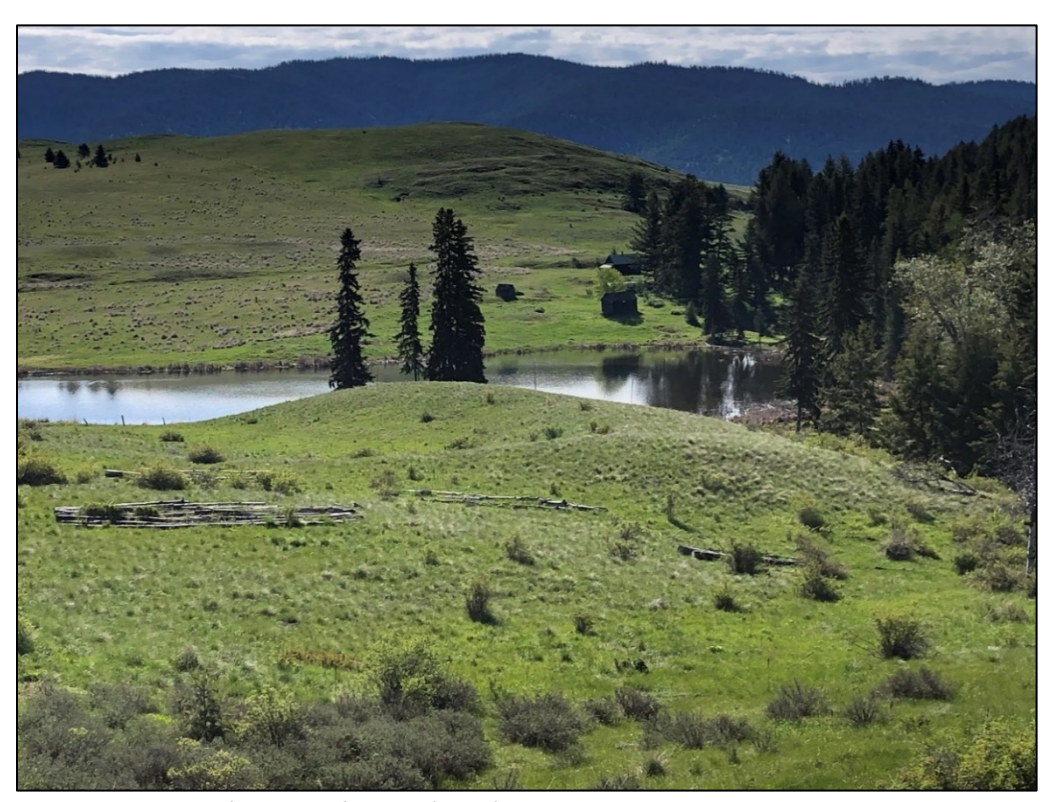
Strawberry Lake on the Chesaw Unit