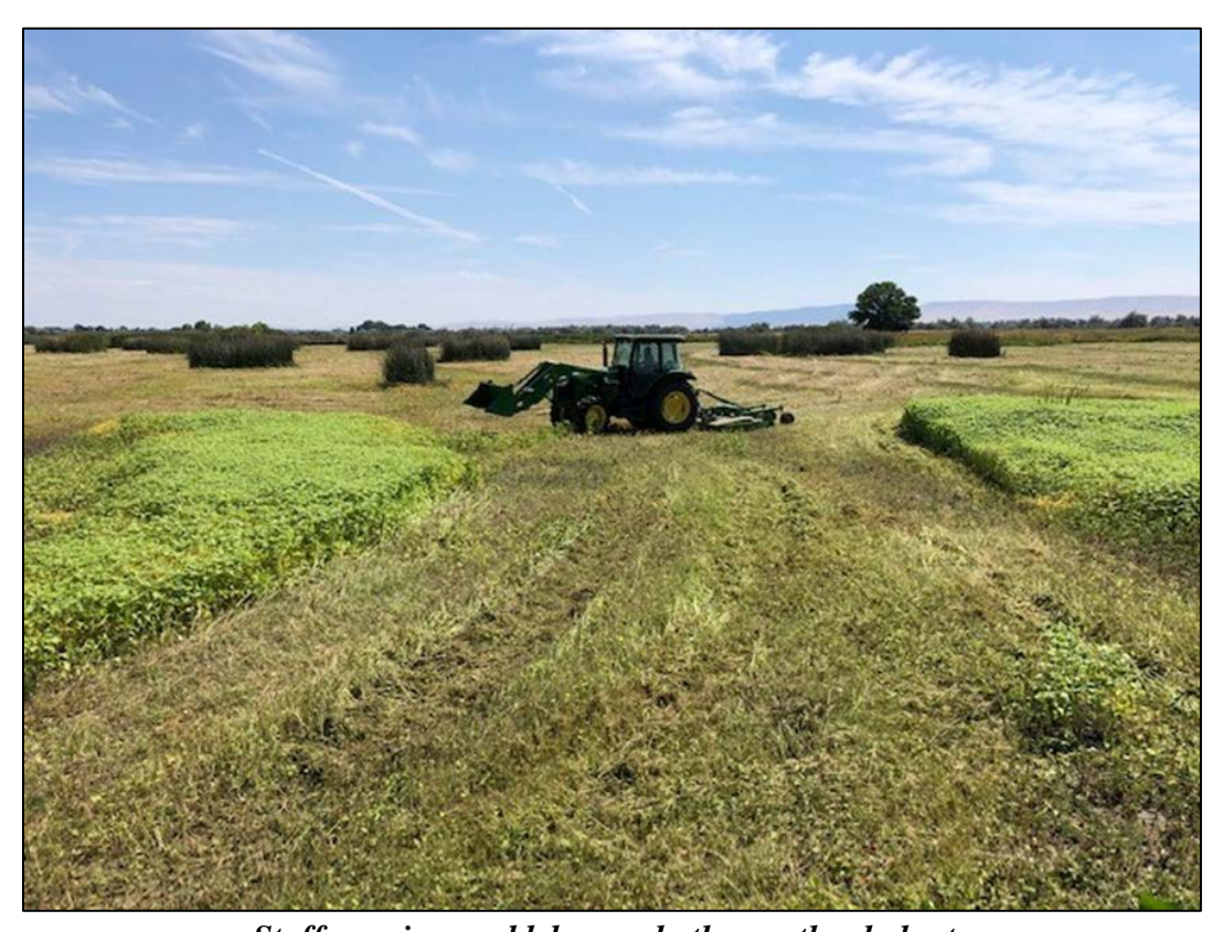
Staff mowing cocklebur and other wetland plants

Sunnyside Wetland Maintenance: Sunnyside Snake River Wildlife Area staff members have been busy mowing wetlands to provide better habitat for migratory waterfowl and recreational opportunities. Seasonal maintenance is required to maintain areas of open water and reduce monocultures of cattail and bull rush. Personnel will be working in the wetlands prior to reflooding in September and October.