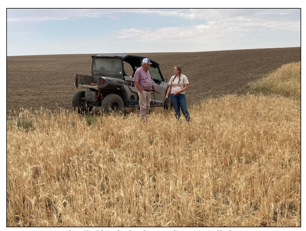
Analyst Todd and a landowner discussing elk damage

Ringold Deer Complaint: District 4 Wildlife Conflict Specialist Hand received and responded to a new deer damage complaint from a large tree fruit operation north of Pasco near Ringold. Two new blocks of cheery trees have been browsed on by deer and the landowner was looking for possible solutions. After surveying the damage, several non-lethal hazing techniques including "Critter Getters" and chemical repellents will be implemented. If the problem continues, hunting pressure either by general season hunters and/or damage permits will be employed.