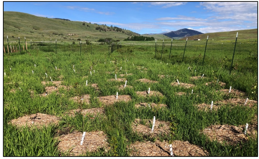
Food plot with good germination and growth from sunflowers but limited growth from corn seeds. W Grant County