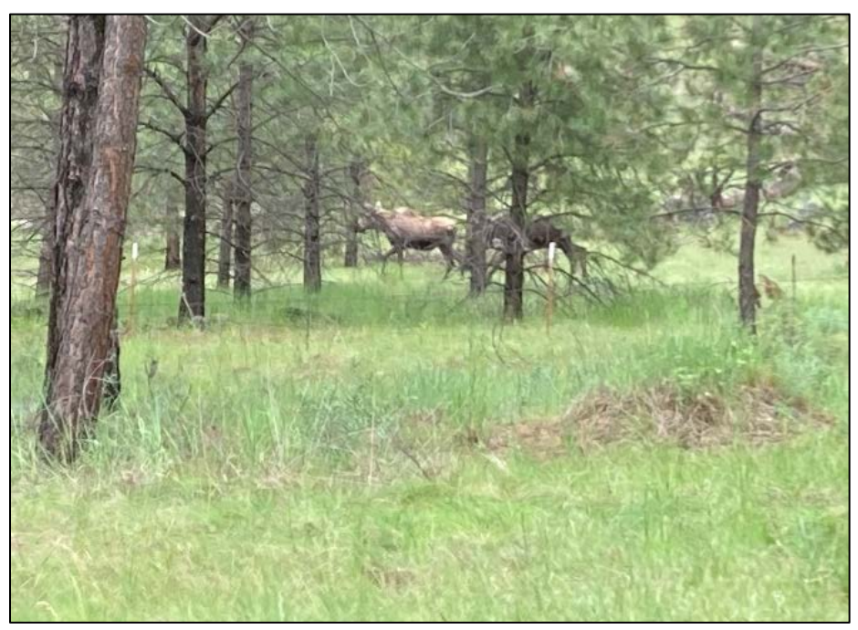
Moose on the Sinlahekin Wildlife Area