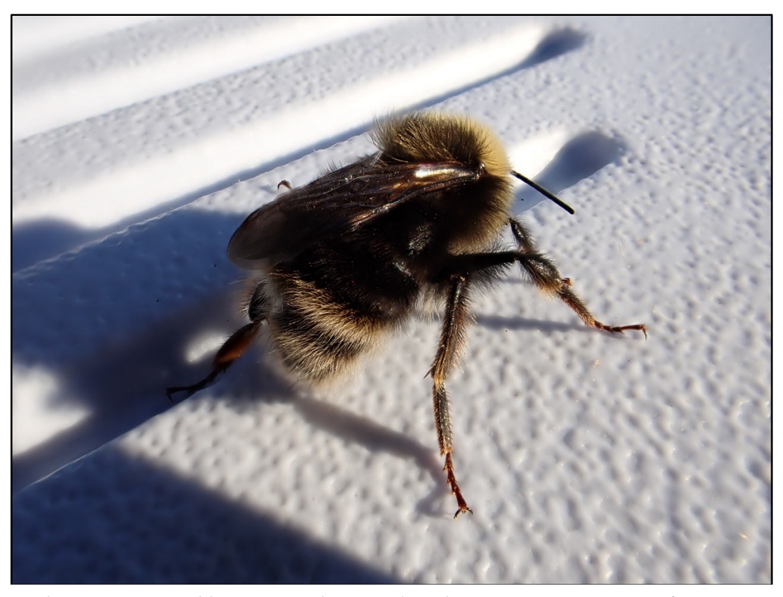
The Western Bumble Bee (Bombus occidentalis). A WDFW Species of Greatest Conservation Need

Bat Monitoring: Biologists conducted emergence counts at three more known bat colonies in Chelan County: a barn on Entiat River Rd, Lake Chelan State Park housing, and a U.S. Forest Service (USFS) warehouse near Lake Wenatchee. The Entiat and Lake Chelan sites have been monitored the previous two summers, and counts were down this year. However, chattering was heard in the roof of the house at Lake Chelan State Park even after the exit appeared to be over, and much chattering was heard in the warehouse by Lake Wenatchee, as well.