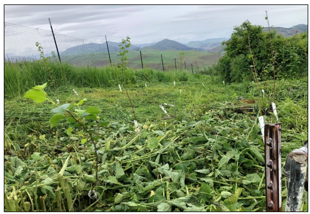
Happy Hill Water birch planting. Water birch is an important food source for Sharptail grouse in the winter when snow limits their ability to forage on the ground. Planted fall of 2021