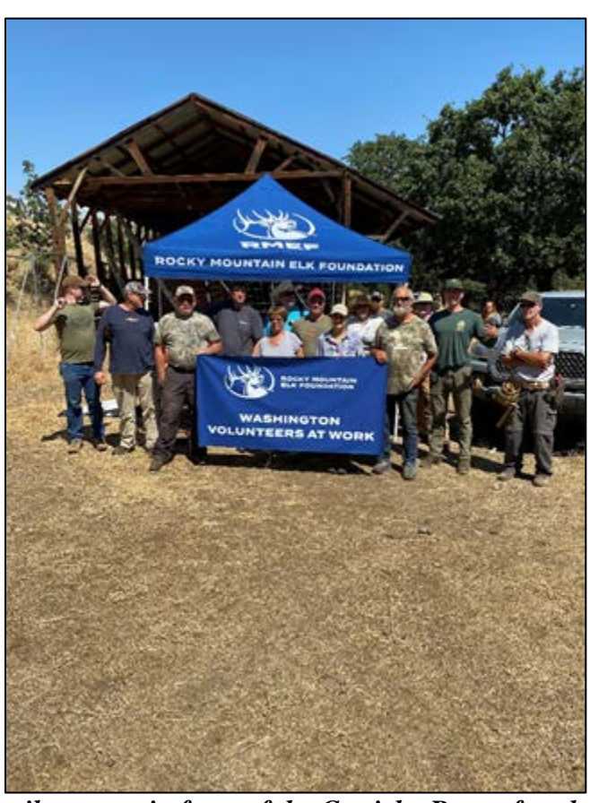
Volunteers strike a pose in front of the Cowiche Barn after the day's work