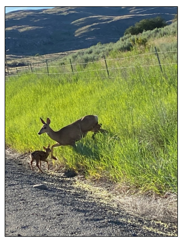
Mule deer doe and fawn