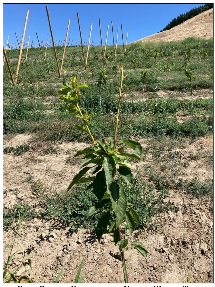
Deer Browse Damage to a Young Cherry Tree

Blackrock Damage Permits: District 4 Wildlife Conflict Specialist Hand prepared Damage Prevention Permits for a landowner in the Blackrock area to address elk damage in his orchard, corn, and alfalfa hay crop.