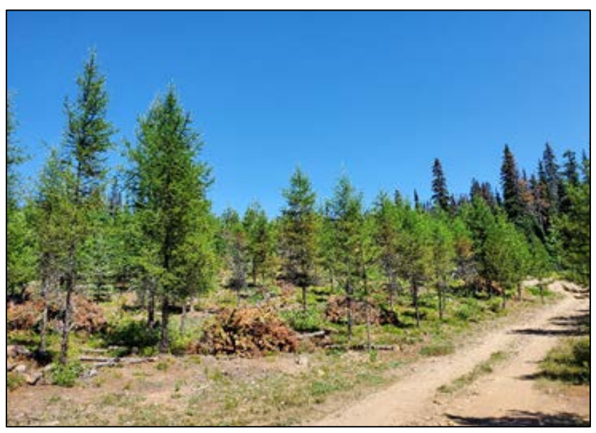
Completed pre-commercial thinning unit in Milk Creek drainage. Sun-loving species like western larch and pine species now have good space to establish a healthy canopy. Slash from cut trees was piled along roads to reduce fire hazard

Milk Creek Pacific Crest trail: Oak Creek Wildlife Area Forester Hartmann inspected precommercial thinning units in the Milk Creek drainage of the Rock Creek Unit of Oak Creek Wildlife Area. The contractor did an excellent job working through very dense stands of small trees and constructing high-quality piles in fuel reduction areas.