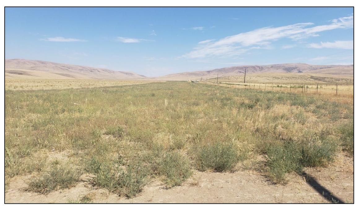
Most of the green vegetation is forage kochia, annual kochia and Russian thistle in this greenstrip along Highway 24

Milk Creek Pacific Crest trail: Oak Creek Wildlife Area Forester Hartmann inspected precommercial thinning units in the Milk Creek drainage of the Rock Creek Unit of Oak Creek Wildlife Area. The contractor did an excellent job working through very dense stands of small trees and constructing high-quality piles in fuel reduction areas.