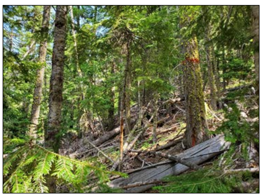
Orange paint bands visible in the foreground and (currently) hidden in the background mark leave trees in Unit two of Windy Point Phase one

Windy Point Forest Restoration: Oak Creek Wildlife Area Forester Hartmann met with contractor staff members to discuss work on Phase One of the Windy Point Thinning Project. Work on Phase One should begin by the end of August. Phase Two of the project is in the early planning stages; a multi-stakeholder tour is scheduled for the beginning of September.