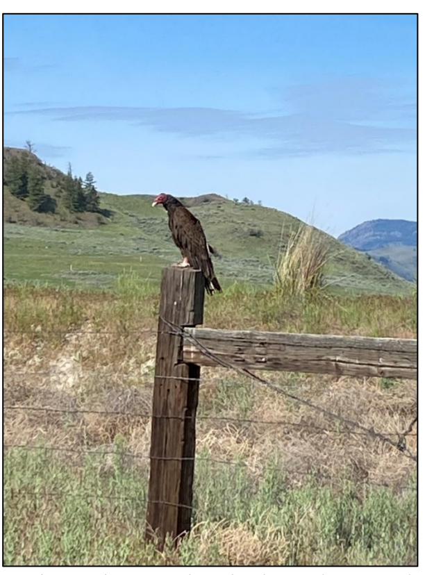
Turkey Vulture on the Charles and Mary Eder Unit