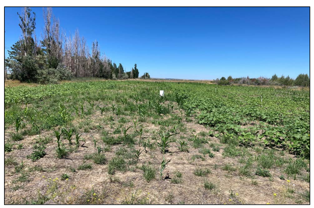
Aspen, Water birch, Choke Cherry and Hawthorne planted in the project area by the Tonasket and Oroville 5<sup>th</sup> graders

Biologist Cook also visited food plots planted this spring. Two of the three plots are not growing well, and irrigation failures may be the primary factor. Low germination of a seed batch may be another factor because some species are growing better than others. They also planted triticale in a wildlife food plot that had poor establishment earlier in the year. Wildlife food plots provide standing forage in the fall and winter that can help support a wide variety of wildlife, including big game, small game and upland birds, and non-game birds and small mammals.