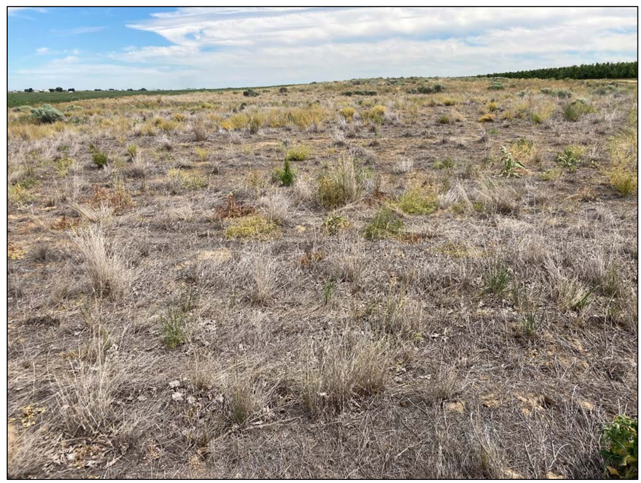
Weeds showing signs of dying after herbicide application, site to be planted with native grass in Fall 2022 in West Grant County

Okanogan Lands 20/20 Project Submittals: Okanogan Lands Operations Manager Haug submitted five applications for acquisitions in Okanogan County. The projects protect critical shrub-steppe and riparian habitats and increase recreation opportunity in the area. The applications will be reviewed later this month and then presented to staff in Olympia for approval.