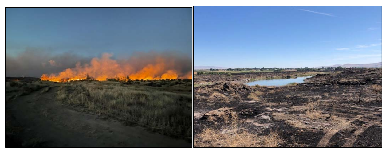
Byron Unit Fire