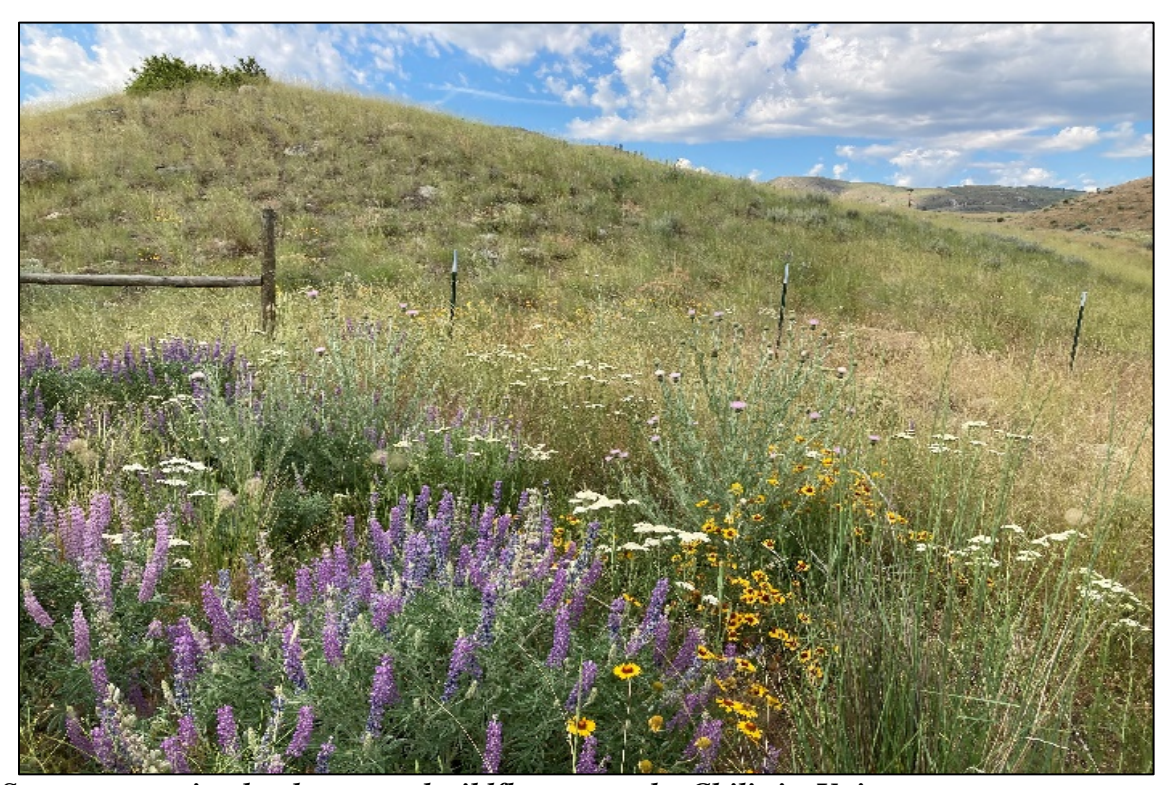
Summer morning landscape and wildflowers on the Chiliwist Unit