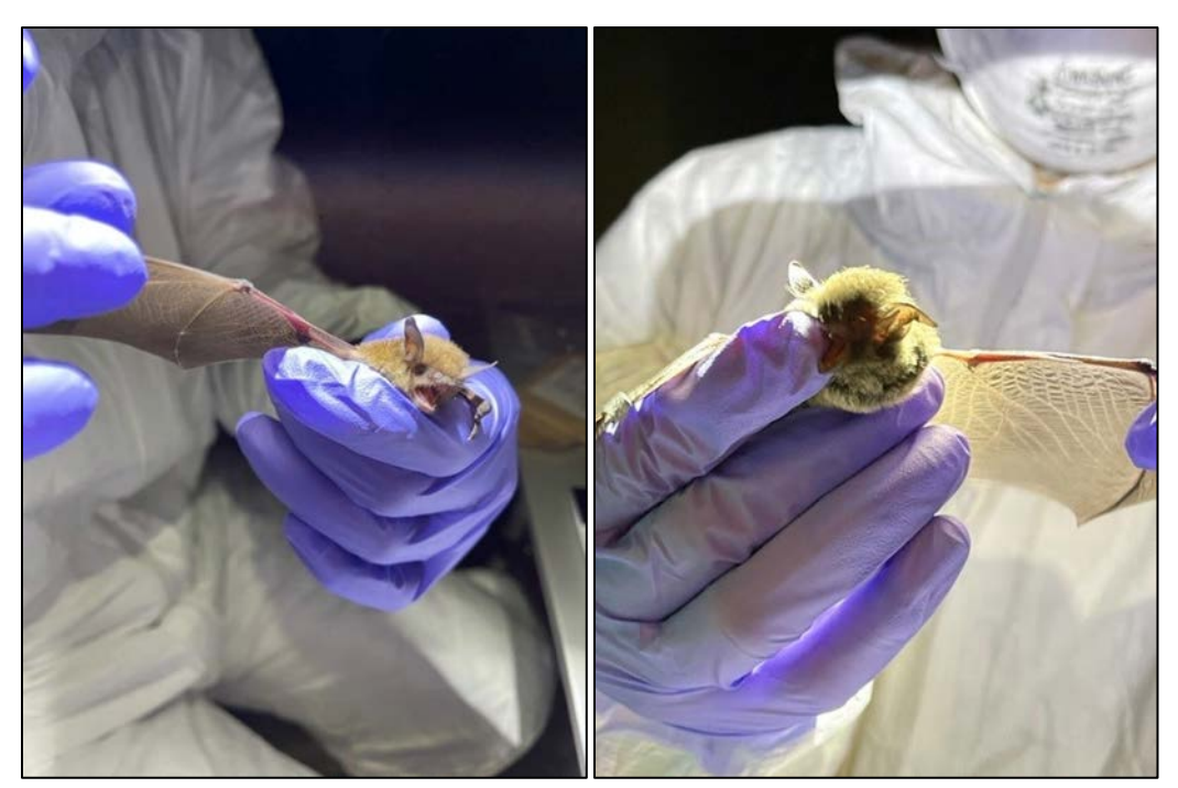
Bat sampling and Pit tagging

Migratory Bird Banding: District 8 ended dove banding with 300 bands deployed by volunteers, a very good hatch for the second year. Volunteers and staff members started baiting ducks and eventually set up traps at Sunnyside and Moxee. After a slow start, ducks showed up in good numbers and banding will begin soon. The cellular cameras have been saving a lot of time and travel. The photos let us know when sites need to be re-baited, when enough ducks are present to justify setting traps, and the best times to run traps.