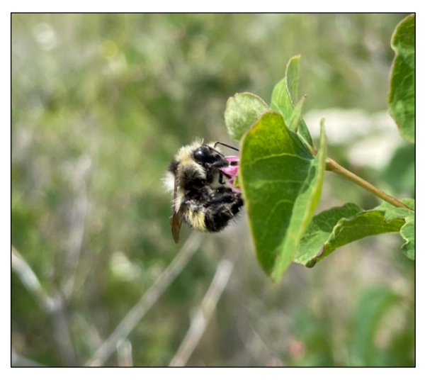
Central bumble bee (Bombus centralis) getting ready to take off after processing (L) and two-form bumble bee (Bombus bifarius) visiting a snowberry (R; Symphoricarpos albus).

The data collected from this survey were entered into the Pacific Northwest Bumble Bee Atlas online database. The PNW Bumble Bee Atlas is a collaborative effort between WDFW, Idaho Department of Fish and Game, Oregon Department of Fish and Wildlife, and the Xerces Society for Invertebrate Conservation to track and conserve the bumble bees of Washington, Idaho, and Oregon.