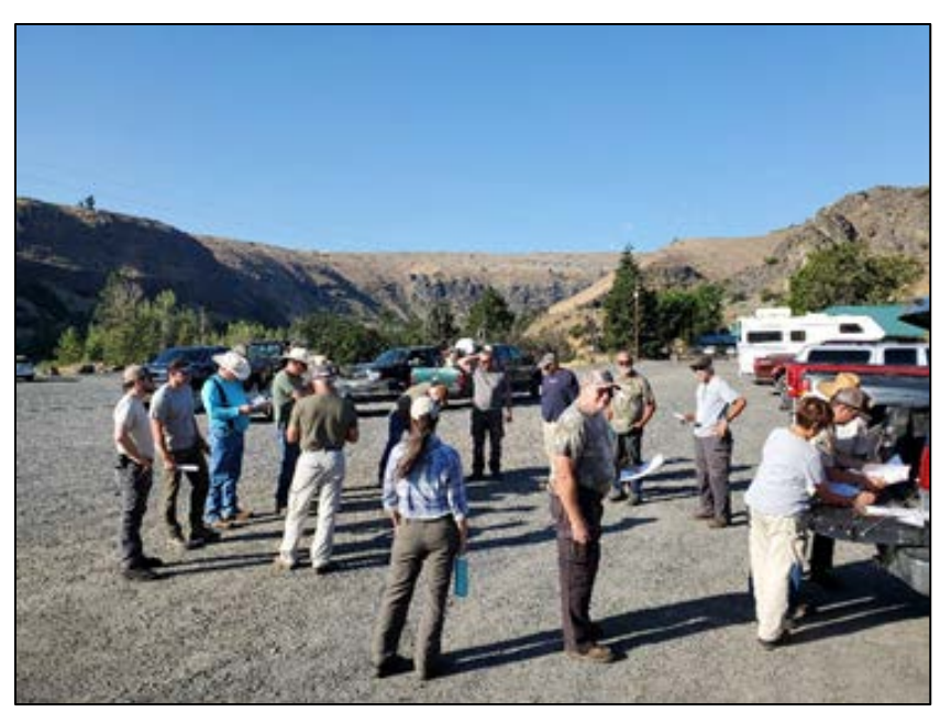
Volunteers gather in the Oak Creek parking lot to review the day's activities