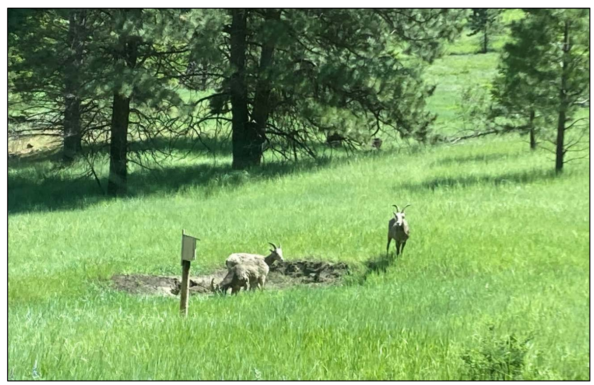
Bighorn sheep on a natural mineral lick near Blue