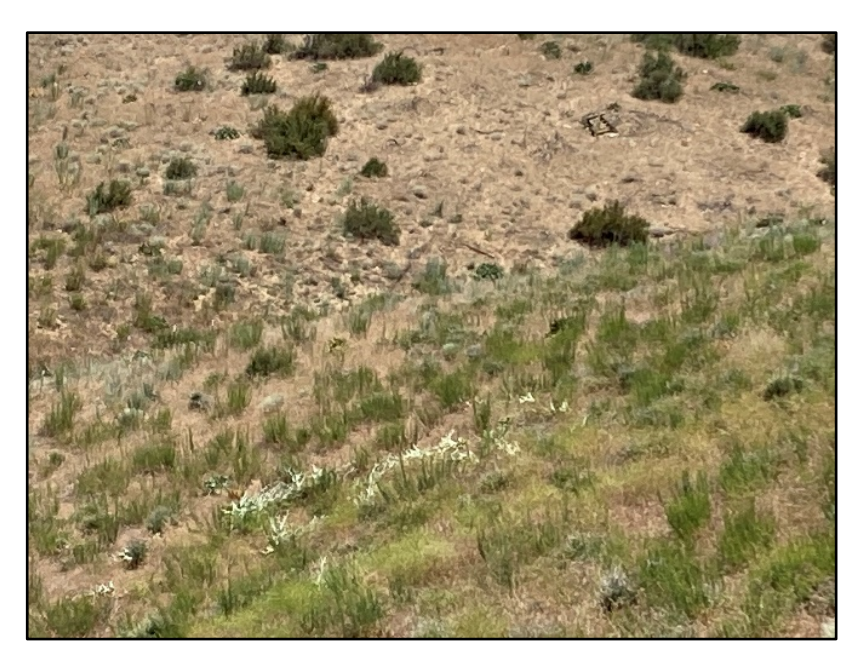
Scotch Thistle infestation on the Chiliwist Wildlife Area

Sinlahekin WLA Noxious Weeds: Sinlahekin Staff members have been treating noxious weeds on the Chiliwist Unit. They have been using a variety of methods to treat the weeds from herbicide to hand pulling. This continued treatment has made a noticeable change in the amount of Scotch Thistle on the unit. Staff members will continue to treat the Scotch Thistle throughout the summer. Some of the plants have started to bolt, staff members will be clipping seed heads and spraying rosettes.