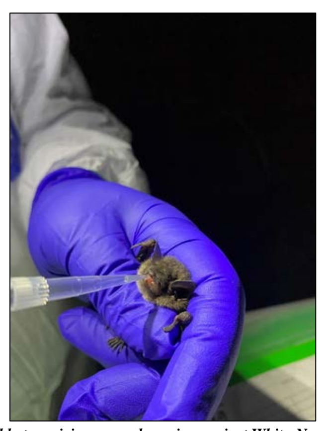
A captured bat receiving an oral vaccine against White-Nose Syndrome

Bat Vaccinations: District 8 staff members in collaborations with U.S. Geological Survey (USGS), assisted in the administration of vaccination trials for the treatment of White-Nose Syndrome (WNS) in a resident bat colony. Multi-year monitoring has indicated colony decline in this white-nose positive population of little brown bats, Myotis spp . Bats were captured and randomly selected to receive a vaccine or control dosage. Captured bats will be monitored to assess vaccination efficacy.