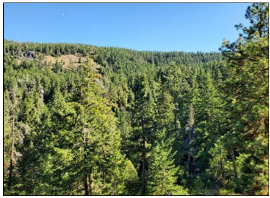
Phase overlook from one of the stops stakeholders will visit at the September tour