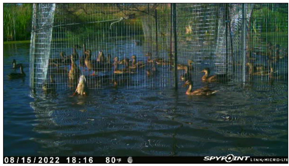
A Full Trap evening at Moxee

Bumble Bee Surveys: District 4 Wildlife Biologist Fidorra conducted a second round of bumble bee surveys on the Mesa Unit of Sunnyside Snake River Wildlife Area. Three bees were captured, believed to be Brown-belted Bumblebees. Fidorra uploaded photos and data to the Pacific Northwest Bumblebee Atlas Portal from this season's surveys.