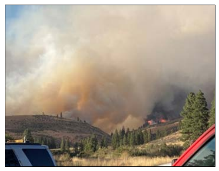
Cow Canyon Fire a few hours after the start of it on Aug. 3

Cow Canyon Fire: The Cow Canyon Fire started close to BBQ Flats on DNR ground in the Wenas Valley on Aug. 3. The response shown for this fire was amazing and it really made a difference with getting it under control. By Aug 12, the fire was over 90% contained. The Wenas Wildlife Area closed for about a week due to the active fire. Staff members spent time posting signs for the closure. Manager Hughes coordinated with incident command and other resources involved heavily with the fire. A total of 5,832 acres burned, with approximately 614 acres burning on the Wenas Wildlife Area. Majority of the fire burned DNR and private ownership. The biggest impact of the fire was on the landowners within the community, it burned two homes, one cabin, and 11 outbuildings.