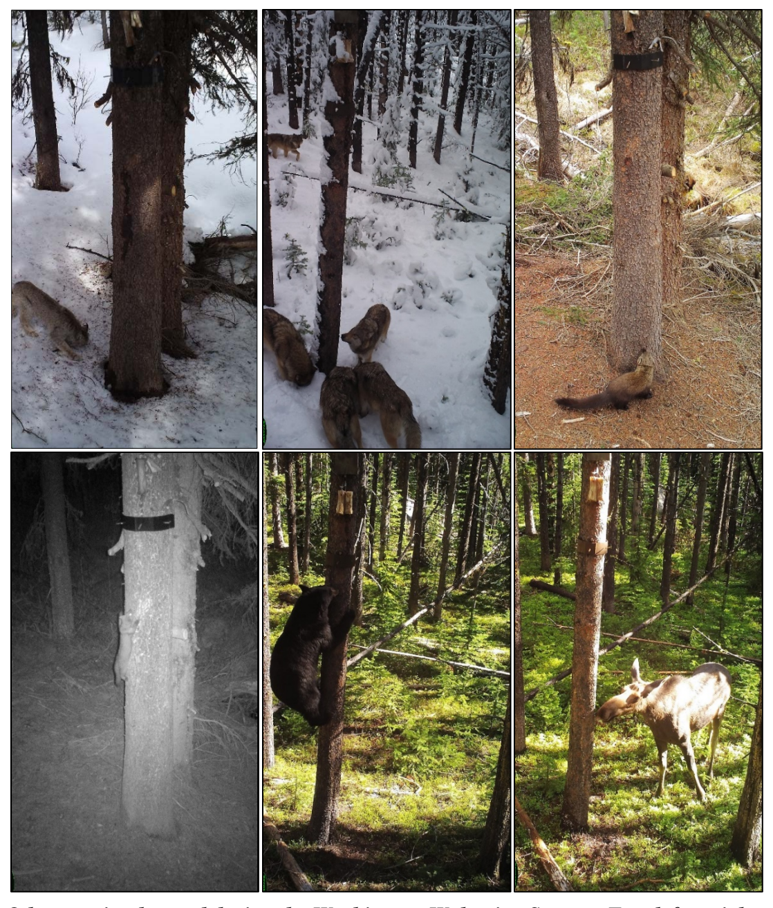
Other species detected during the Washington Wolverine Survey. Top, left to right: Lynx, Wolf, Fisher. Bottom, left to right: Marten, Black Bear, Moose