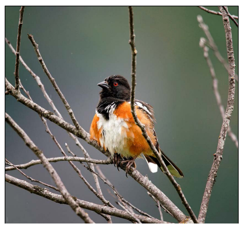
Towee drying off near the Dave Brittell Trail on the Sinlahekin WLA