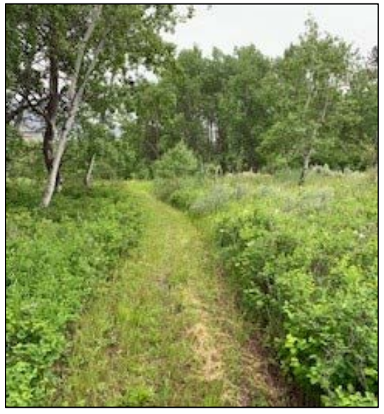
Unauthorized trail mowing on the Methow Wildlife Area