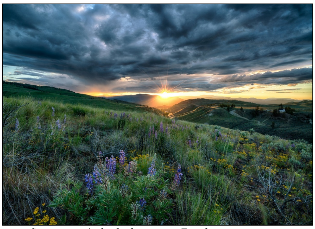
Stormy sunset in the shrubsteppe over Tonasket