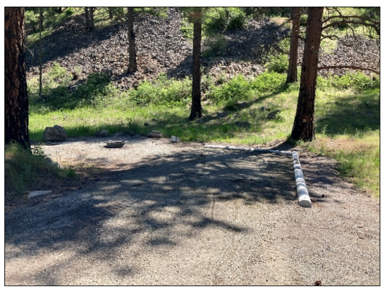
Finished camping pad with packed gravel, bumpers, and fire ring — Photo by N. Wehmeyer.

Sinlahekin Campground Renovations: Sinlahekin Staff members finished up the campground upgrades by installing gravel on some of the access roads to the campgrounds that were in much need of repair, along with adding gravel to many of the camping pads at the various campgrounds. Staff members also installed parking bumpers and gravel around the picnic tables that were installed at some of the sites. This has been part of the Recreation Conservation Office (RCO) Campground Renovations grant. Many of these sites have been used regularly and are a big hit with campers. We have received many thanks from the public on the upgrades.