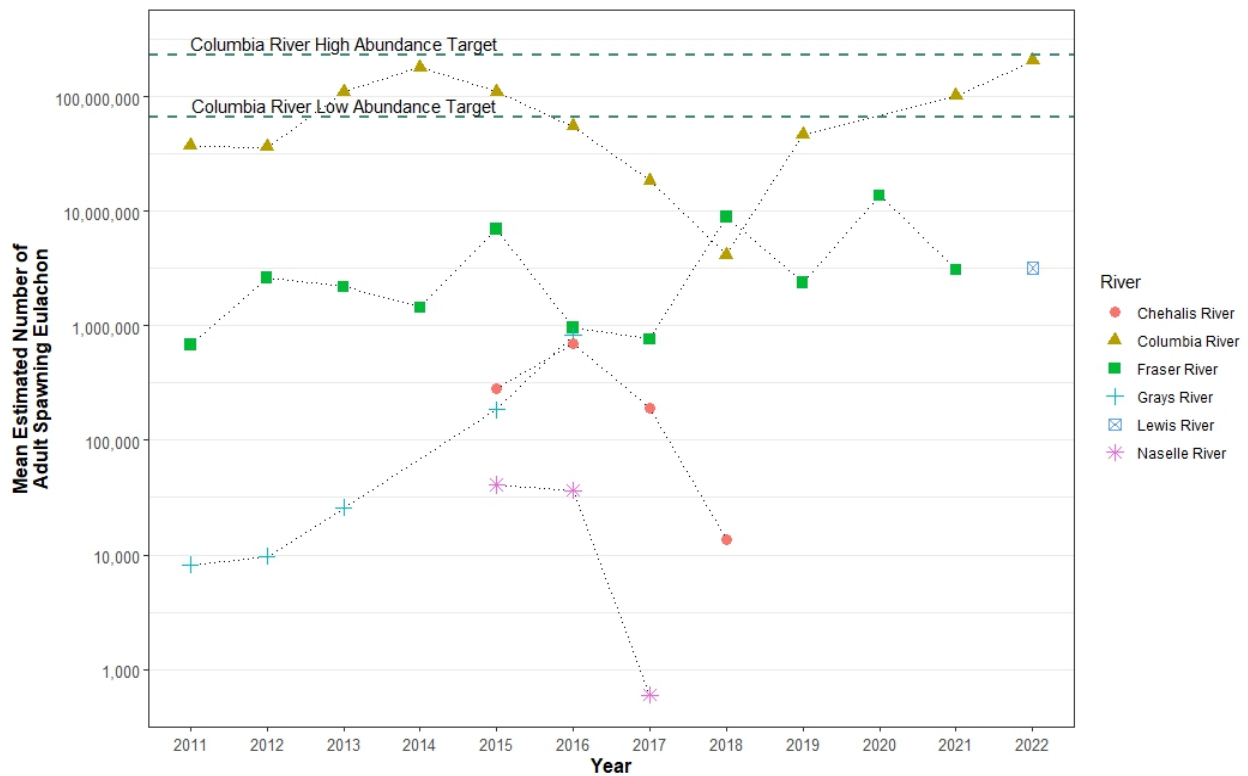
Figure 2. The estimated number of Eulachon spawning in the Columbia, Fraser, Chehalis, Naselle, and Grays rivers in 2011–2022. Estimates are calculated by multiplying the annual Spawning Stock Biomass (SSB) total weight by a standard 11.16 fish per pound. Estimates for the Fraser River derived from data provided by the Canadian Department of Fisheries and Oceans (DFO). The Fraser River estimate for 2022 was not finalized at the time of this publication. No estimate for the Columbia River is available for 2020 due to truncated sampling.

In 2005, Columbia River average larval densities reached the lowest recorded levels since the inception of the larval sampling program and remained depressed for at least six years (longer than the average generation cycle for the species; Figure 3 and Table 21). Despite several low adult runs in preceding years, the larval densities rose during 2011, and reached a then-record level in 2014. Prior to 2011, annual Eulachon larval densities for the mainstem Columbia River aligned well with the adult CPUE trend from commercial mainstem fisheries (Figure 3). Commercial CPUE data shows that a similar trend occurred after the initial population crash in the mid-1990s—i.e., low larval production in 1994–2000 followed by a spike in adult returns and larval densities in 2001. Strict restrictions imposed on fishing periods during the 2014–2018 commercial fishery altered the fishing effort around the tidal cycle and reduced the strength of the relationship between larval density and CPUE.