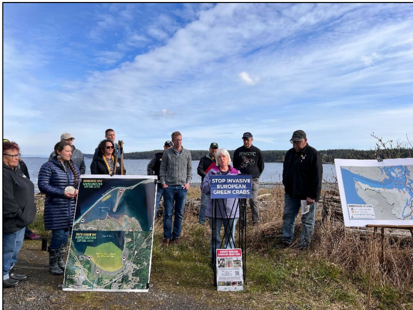
Above: U.S. Senator Patty Murray and Congressman Derek Kilmer touring southern end of Sequim Bay on April 5 with leaders from the Jamestown S’Klallam Tribe along with local environmental advocates and experts.