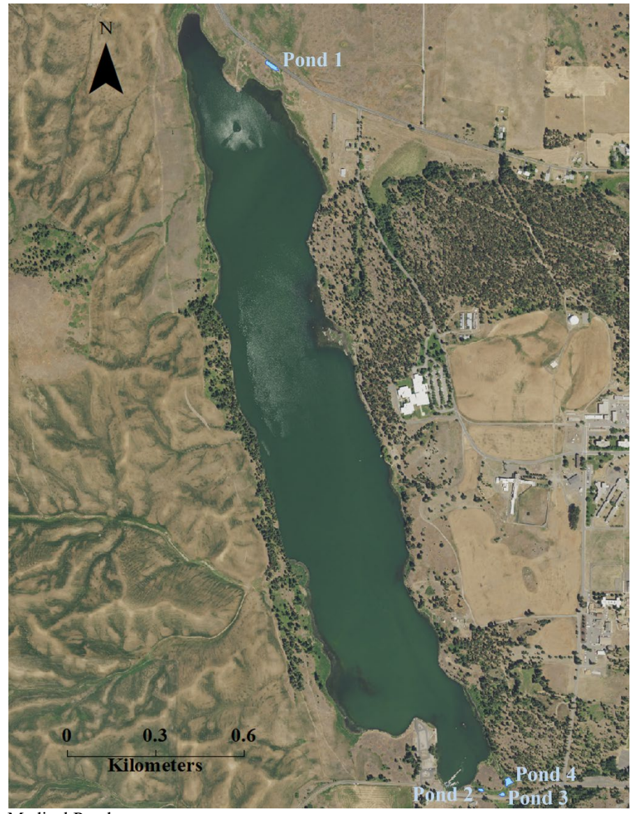
Figure 2. West Medical Ponds.