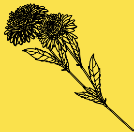
Aster ( Camassia quamash ) Flowers for pollinators