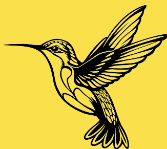
Penstemon/ Beardstongue ( Penstemon serrulatus ) used by: Hummingbird