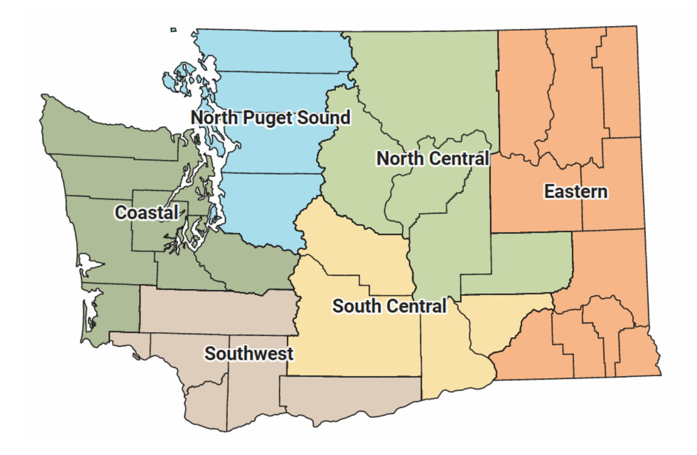
WDFW Regions: 9 or fewer training passes at a time per WDFW Region.