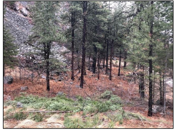
Tree thinning on Sinlahekin Wildlife Area.