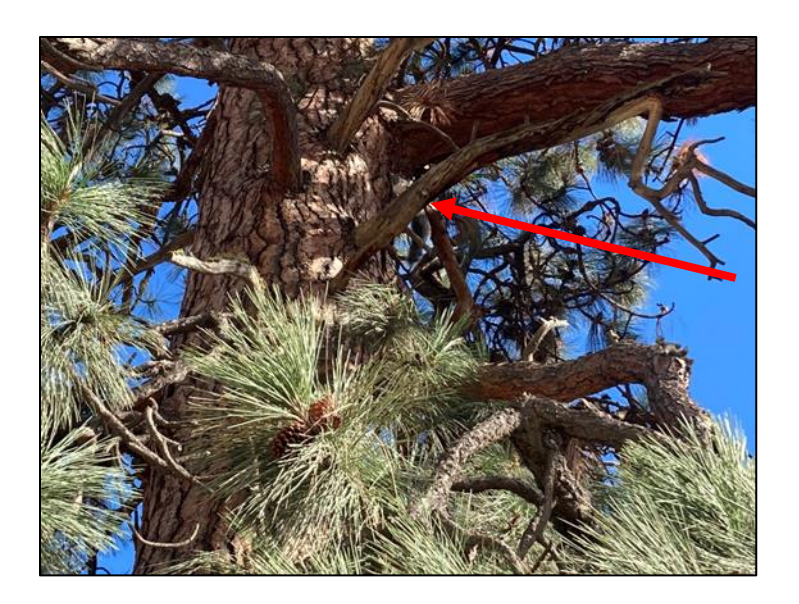
Gray Squirrel on Sinlahekin