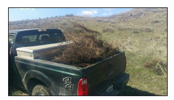
Chiliwist fence removal.