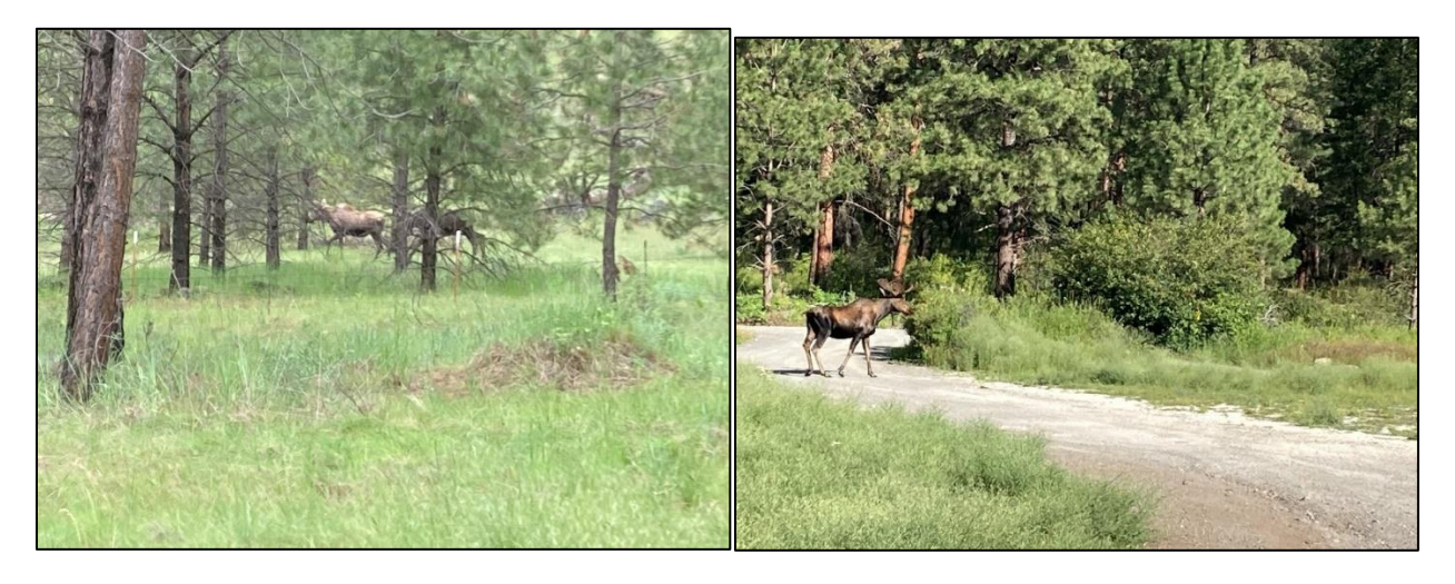
Moose on Sinlahekin Wildlife Area.

New Acquisition - McLoughlin Falls West (Goal #1) was acquired during 2022 and added approximately 339 acres to the Sinlahekin Wildlife Area. The purchase was part of a collaboration with the Colville Confederated Tribes who acquired 388 acres to the north. Wildlife area staff are working on building an access site to the property from Crumbacher Road, south of Tonasket, with the hope of building a small parking lot to help keep vehicles from parking on the side of the county road.