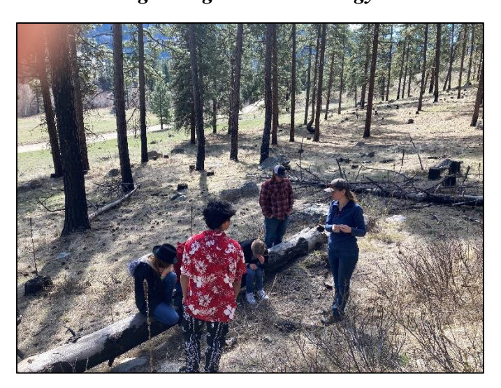
Oroville High School Students learning about prescribed fires.