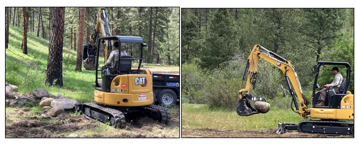
WDFW staff placing barrier rock.

Sinlahekin Campground Renovations Project (Goal 7) – Barrier rock has been placed at various campgrounds on the Sinlahekin unit to minimize off road and better define improved campsites. In many areas old barb wire fencing was used as a barrier, but since has been removed. Twenty aspen trees were planted last fall in various sites within the campground to provide future shade. Staff also planted more aspen this spring at those sites. This was completed using funds obtained from a Recreation Conservation Office grant for campground renovations.