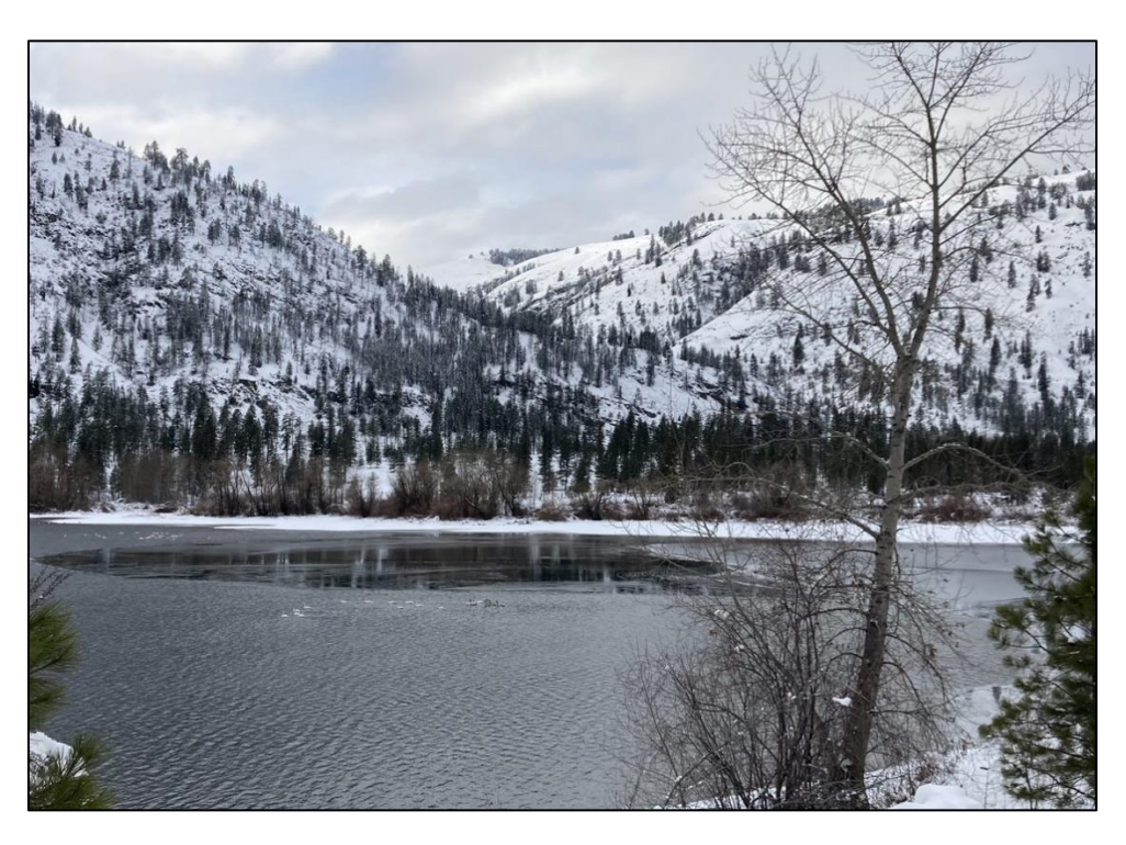
Swans on Blue Lake.

2021-22 Wildlife Area Management Plan Update