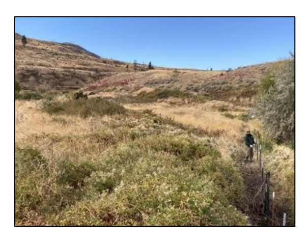
Repair of boundary fence.