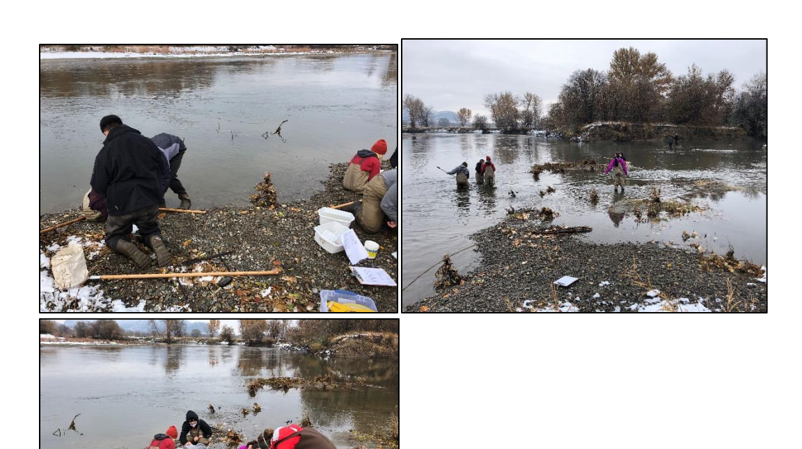
Above Okanogan High School Ecology Class.