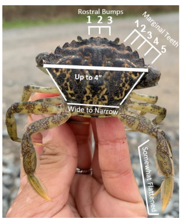
Graphic showing how to identify invasive European green crabs emphasizing the five spines.

More information is available online at <a href="wdfw.wa.gov/greencrab">wdfw.wa.gov/greencrab</a>