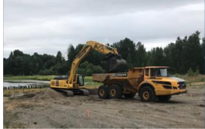
South Bachelor Island Restoration Project