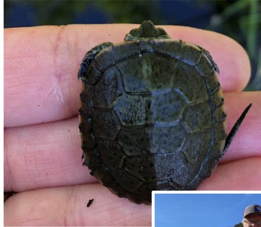
Northwestern Pond Turtle research