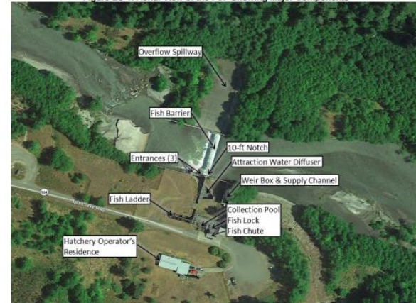
Figure ES-1. Aerial View of the FCF Showing Major Components