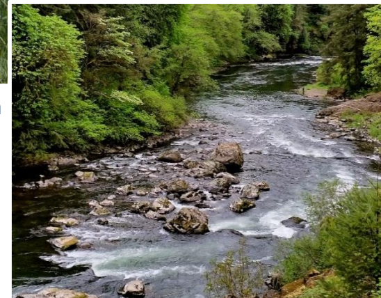
Spring on the Kalama River