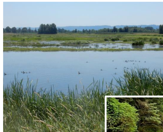
Shillapoo Wildlife Area