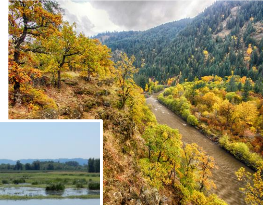
Fall on the Klickitat River