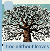
tree without leaves