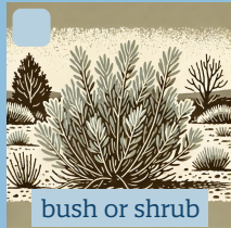
bush or shrub