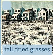
tall dried grasses