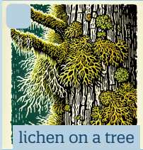
lichen on a tree