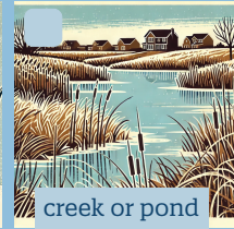
creek or pond