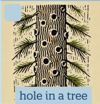
hole in a tree