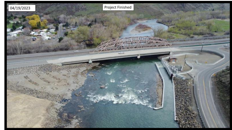
Nelson Dam Removed

Describe what partners or other leaders did that was critical.