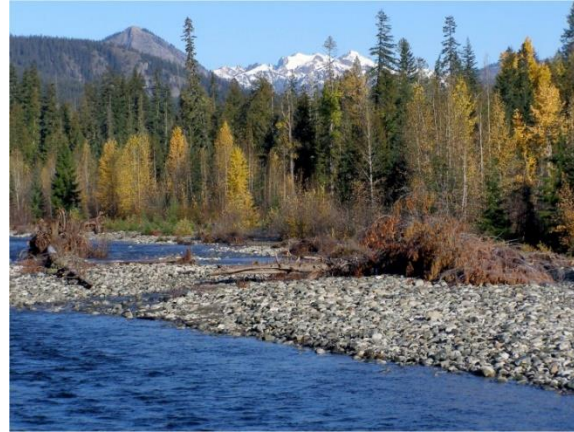
Teanaway River & Forest