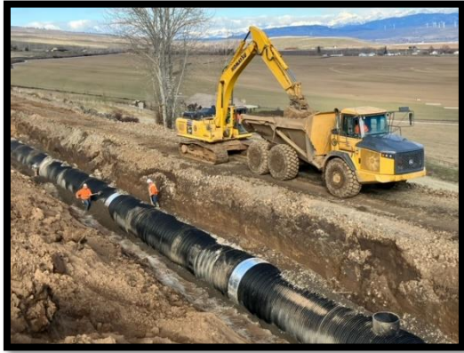
Open ditch to buried pipe