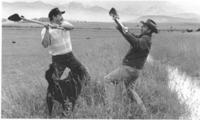
Discussing Water Rights, A Western Pastime