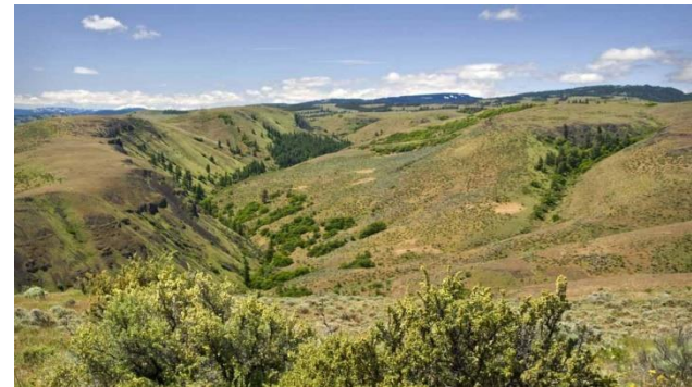
South Fork Cowlitz & Shrub Steppe Protected