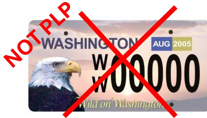
Special Background Plate