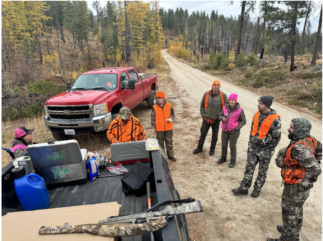
Family talking after the morning hunt.