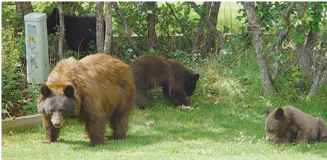
Don't force a mother black bear to defend her cubs.

If you live in or travel to bear country and own a dog, sooner or later your dog may encounter a bear. Understanding why some encounters end peacefully and others end with dogs and people being injured or killed can help keep people, dogs and bears safe.