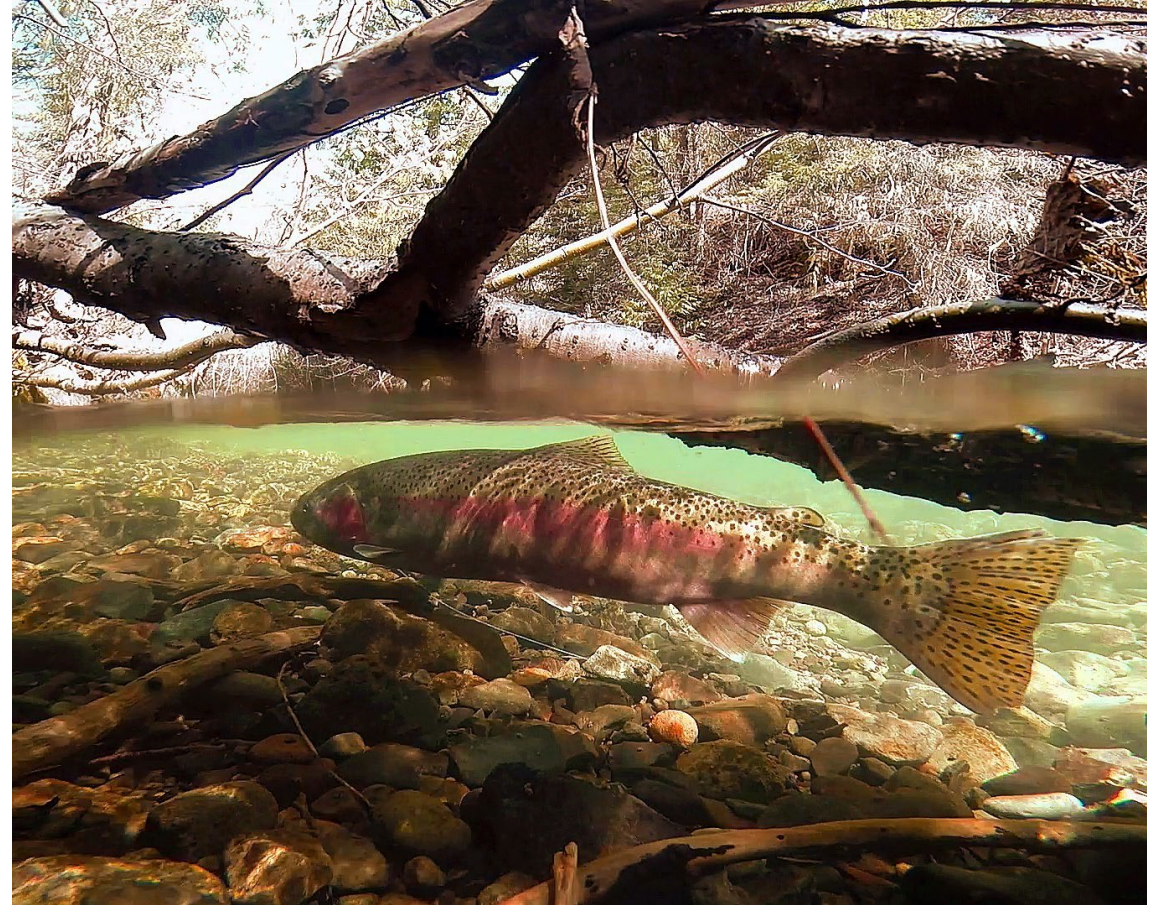
Yakama Nation fisheries

Fund research that examines geographically-specific anecdotes of salmon predation by birds, particularly in Puget Sound. and in places like the Stillaguamish River and the Nisqually River Delta.