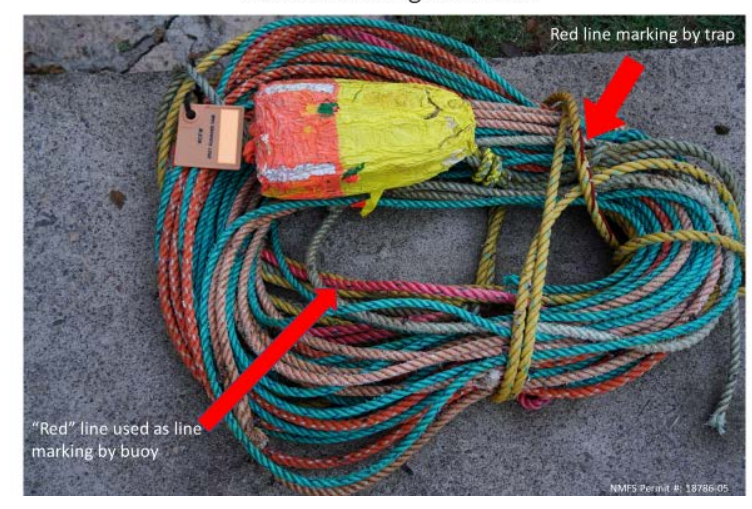
Washington line marking documented on gear recovered from an entangled whale