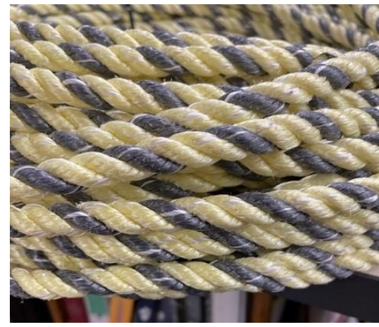
Oregon manufactured line

Carve out for 5 fathoms of line closest to the pot to be any color if the total length of line fished is less than 20 fathoms