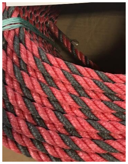
Washington manufactured line