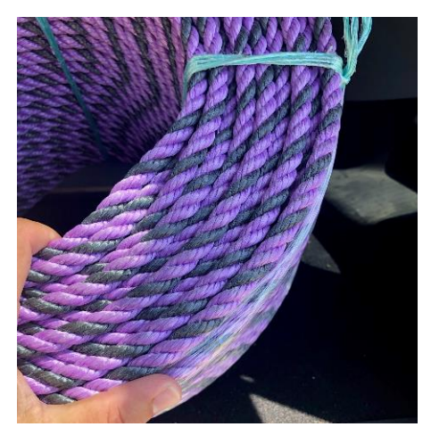
California manufactured line