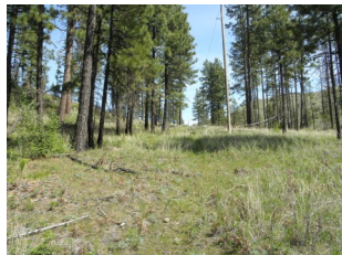
New Campground 6 location

The existing Campgrounds 6 & 9 will not be closed to the public until after Labor Day weekend. Construction of the new Campgrounds 6, 9, & 10 may begin prior to Labor Day, but they will not be open for the public to camp in until the fall.