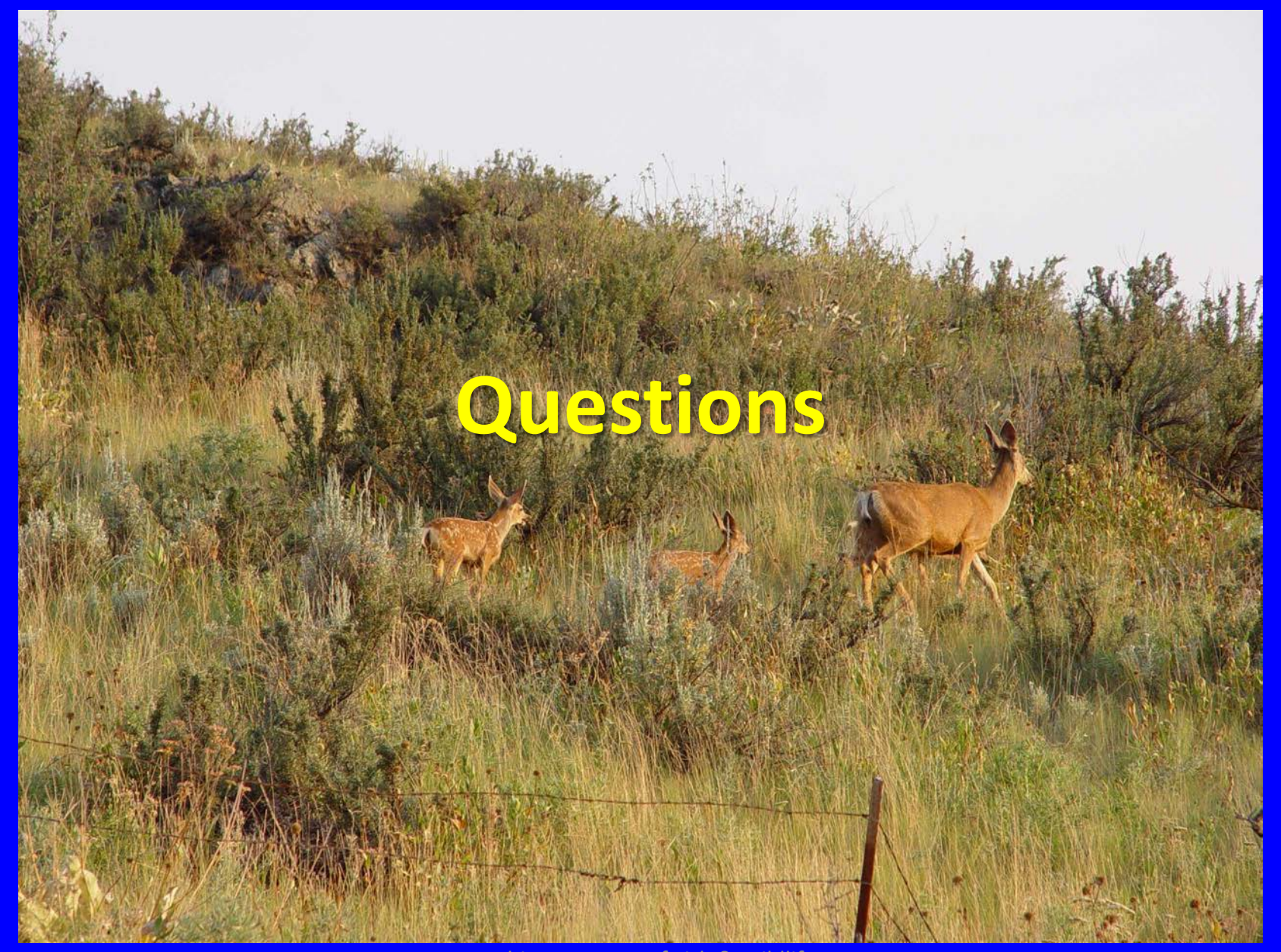
Washington Dept. of Fish & Wildlife Information subject to change and amendment over time.