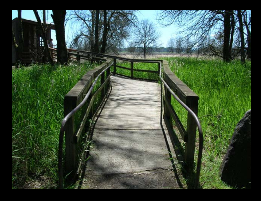
and Disabled Observation Areas