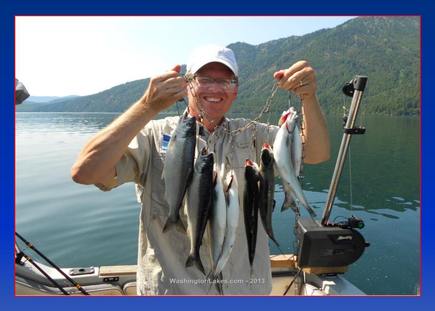
L. Cle Elum "Slot Limit" Kokanee/Sockeye