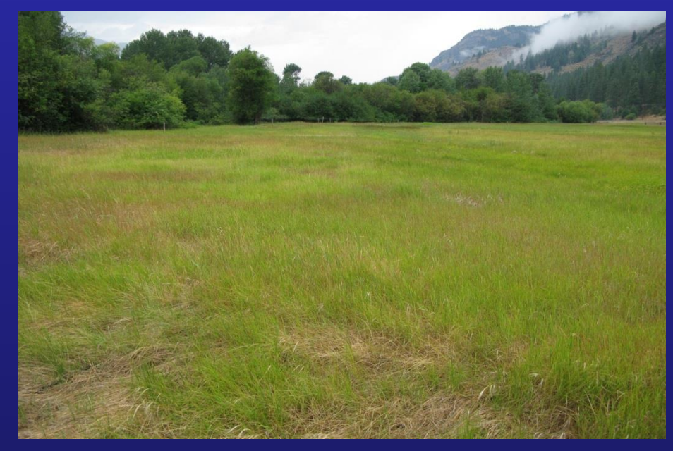
Emergency Pasture, Methow Wildlife Area