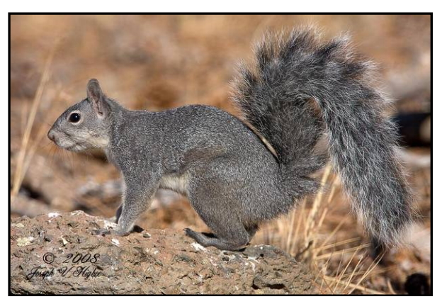
Figure 1. Western gray squirrel.

white on the belly and throat (Carraway and Verts 1994, Verts and Carraway 1998). It also features a long bushy tail that is primarily gray with white-frosted outer edges. The species has prominent ears that can occasionally be reddishbrown on the back in winter (only visible upon close inspection) and are the only part of the animal's pelage that may have any brown. The large size, bushy tail, and gray pelage lacking any brown on the body or tail distinguish western gray squirrels from other squirrels in Washington. Vocalizations include a hoarse chuff-chuff-chuff barking. Three subspecies are recognized, with S. g. griseus present in Washington.