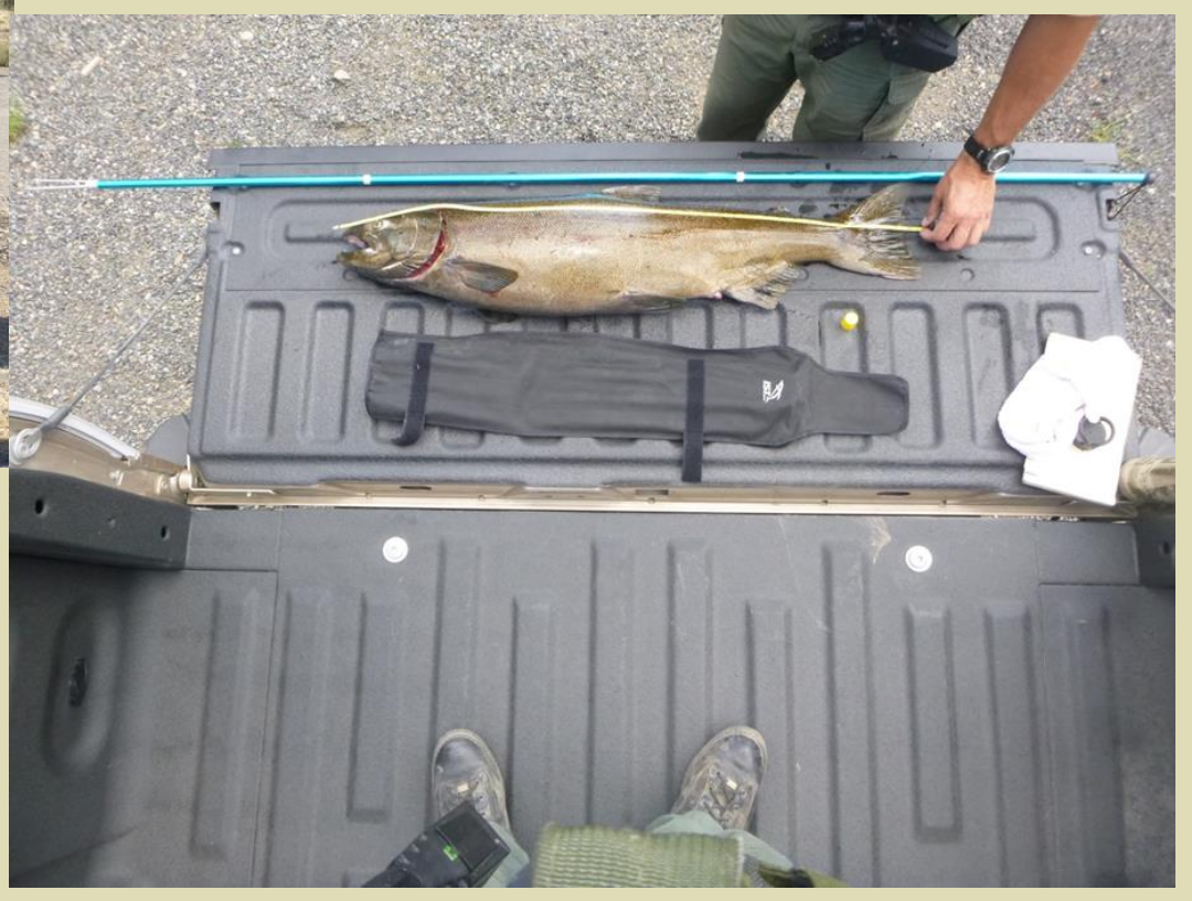
Chinook Salmon speared in the American River.