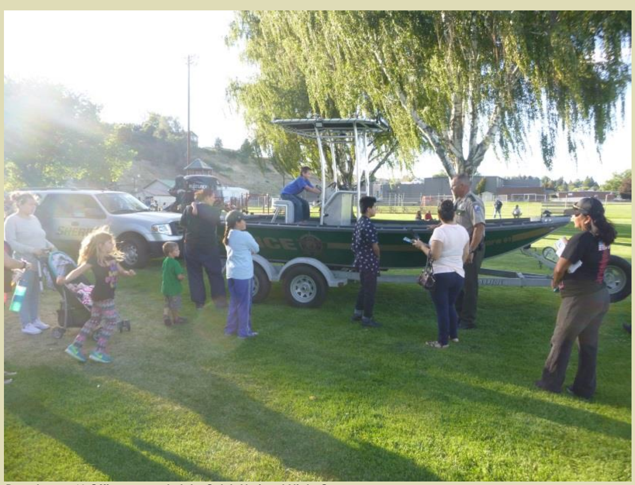
Detachment 18 Officers attended the Selah National Night Out.