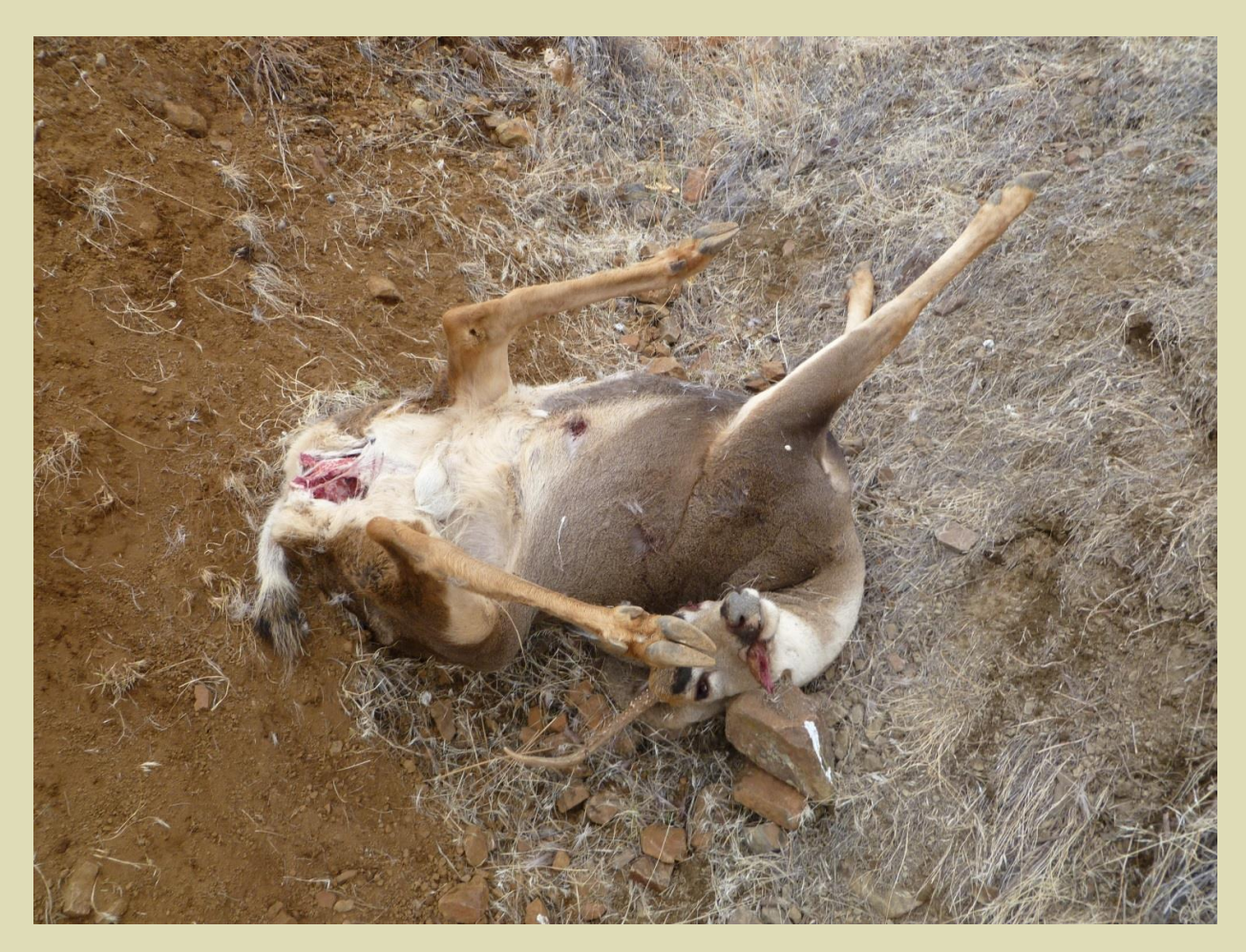
Two-point dumped off the cliff.