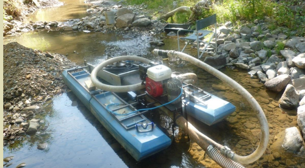
An unattended suction drege in Swauk Creek with several violations.