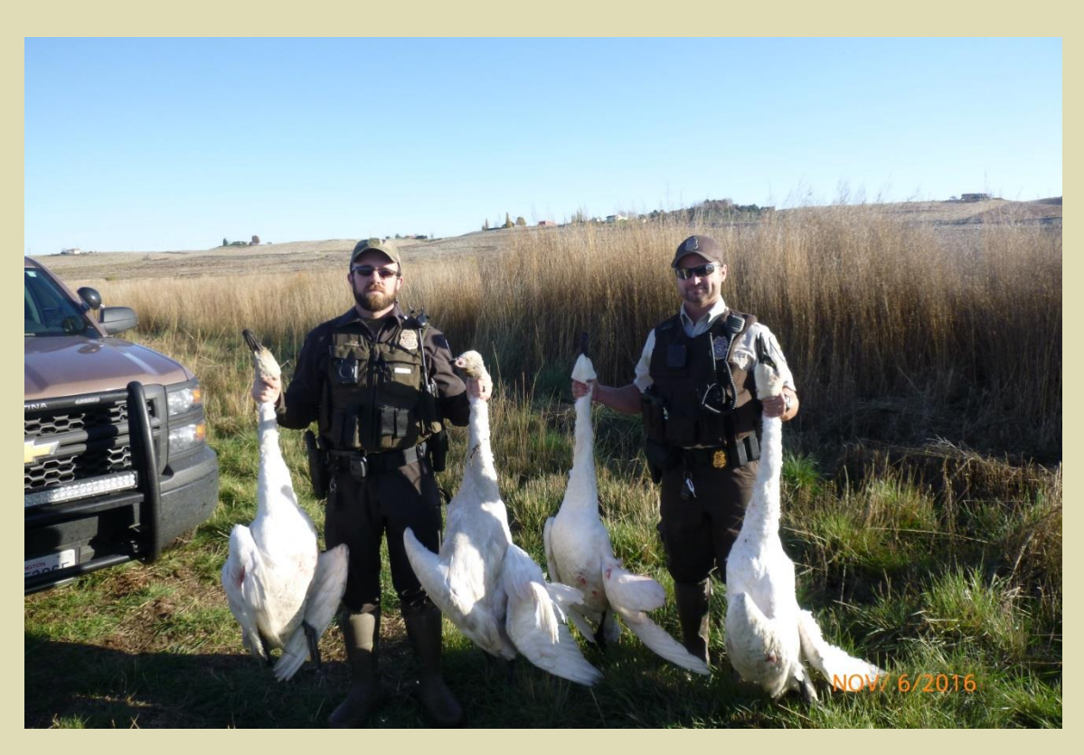
USFWS Refuge Officers with the poached swans.