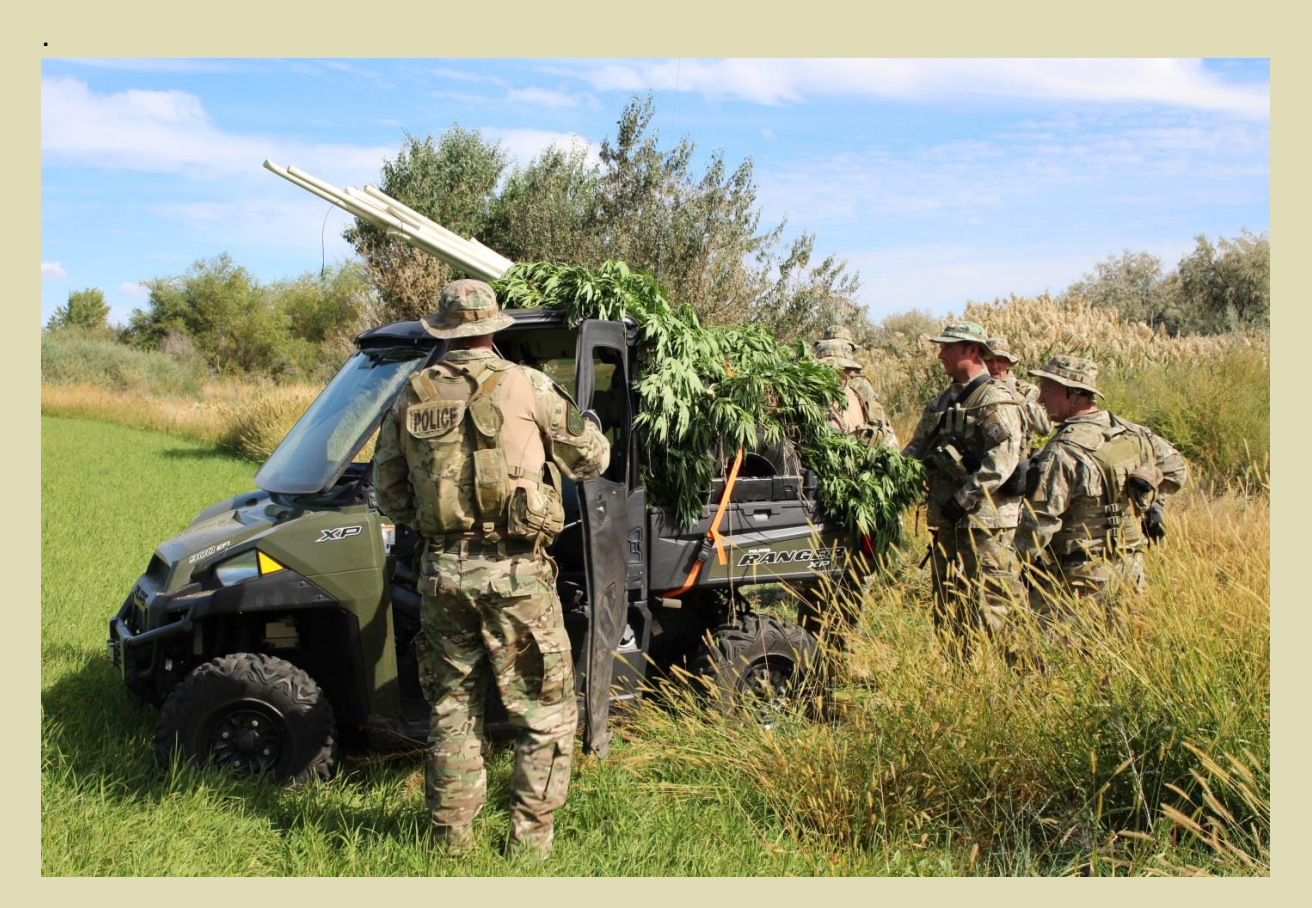
WDFW SOG team members loading illegal marijuana plants and grow items onto ORV.