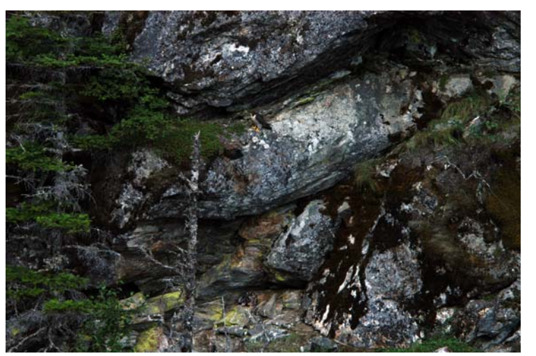
Figure 3. Peregrine falcon on nesting cliff and ledge with young.

The presence of a prominent cliff (Figure 3), tall building, or steel bridge is the most common characteristic of peregrine nesting territories. Cliffs and tall buildings function as both nesting and perching sites and provide unobstructed views of the surrounding landscape. A successful nest site also requires the presence of ledges or potholes that are