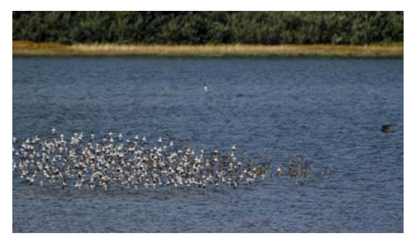
Figure 4. Peregrine falcon in pursuit of shorebirds.

support high densities of shorebirds (Figure 4), waterfowl and other small- to medium-sized birds (Anderson and Herman 2005). Coastal and estuarine areas that are used include beaches, tidal flats, islands, and marshes. Human-altered habitats and environs include agricultural fields (particularly when flooded), airports, and cities where rock pigeons and European starlings are abundant (White et al. 2002). Roost sites are also an important element of wintering habitat. The first radio telemetry study on