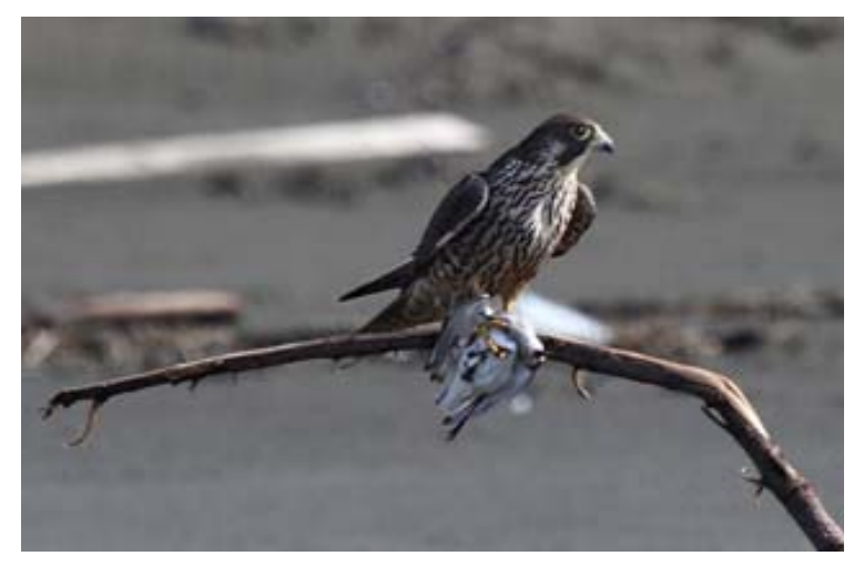
Figure 5. Peregrine falcon with prey.

( Turdus migratorius ), European starlings, rock pigeons, and cedar waxwings ( Bombycilla cedorum ) were the most common prey of peregrines breeding in the San Juan Islands (Anderson 1995, 1996, 1997). These same species constitute the main diet of urban nesting peregrines in Seattle, Tacoma, and Everett sites as well (Ed Deal, pers. comm.). Cade et al. (1996) also lists these species as common prey in cities across North America, and starlings and rock pigeons are common near peregrine nest sites in the Columbia Basin.