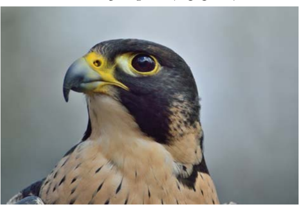
Figure 1. Peregrine falcon.

American peregrine ( F. p. anatum ) and the third, the Arctic peregrine ( F. p. tundrius ) occurring as a migrant or rare winter resident (Varland et al. 2012). The Peale's peregrine falcon occurs in coastal regions of the state, primarily along the outer coast, northern coast of the Olympic Peninsula and the San Juan Islands but always within a half mile of salt water. The American peregrine falcon breeds in the Cascade Mountains, the San Juan Islands, the major cities of the Puget Sound basin, and across eastern Washington. Some peregrines breeding along the outer coast and islands of Puget Sound south to central coastal Oregon may be intergrades