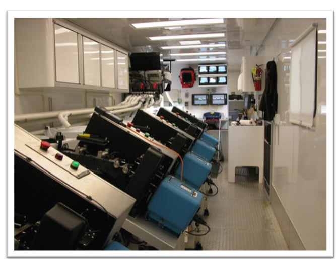
August 9, 2018, WDFW Commission Meeting Presentation