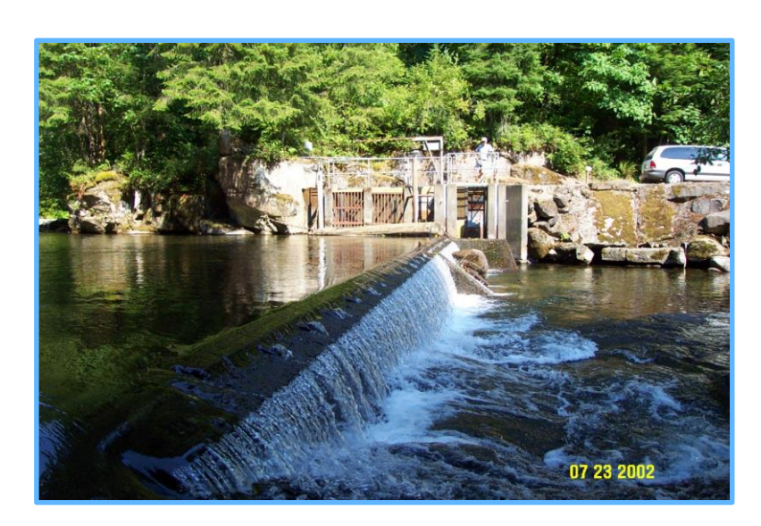
August 9, 2018, WDFW Commission Meeting Presentation