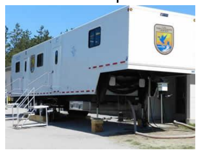
Information is subject to changes and amendments over time.