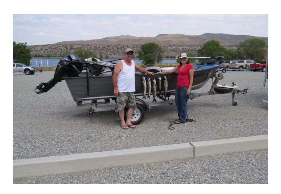
August 9, 2018, WDFW Commission Meeting Presentation