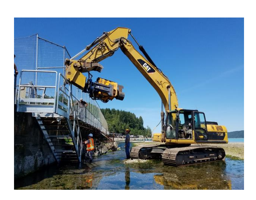
Information is subject to changes and amendments over time.