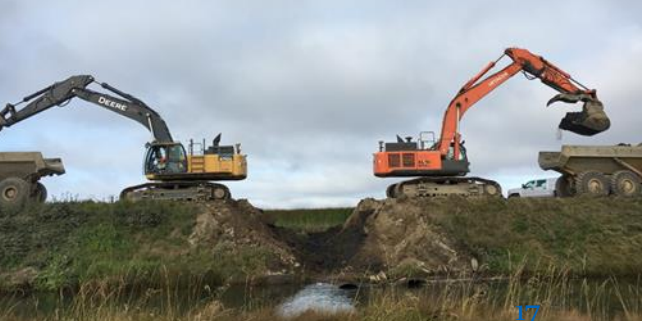
August 9, 2018, WD Meeting Presentatio